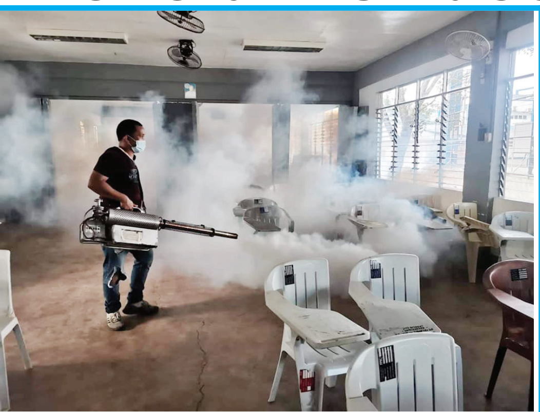
ANTI-DENGUE CAMPAIGN. With the resumption of face-to-face classes next Monday(August 22), the city government of Tacloban through its health office is conducting fogging operations to all public schools in the city to ensure comebacking students and teachers will not get dengue fever.