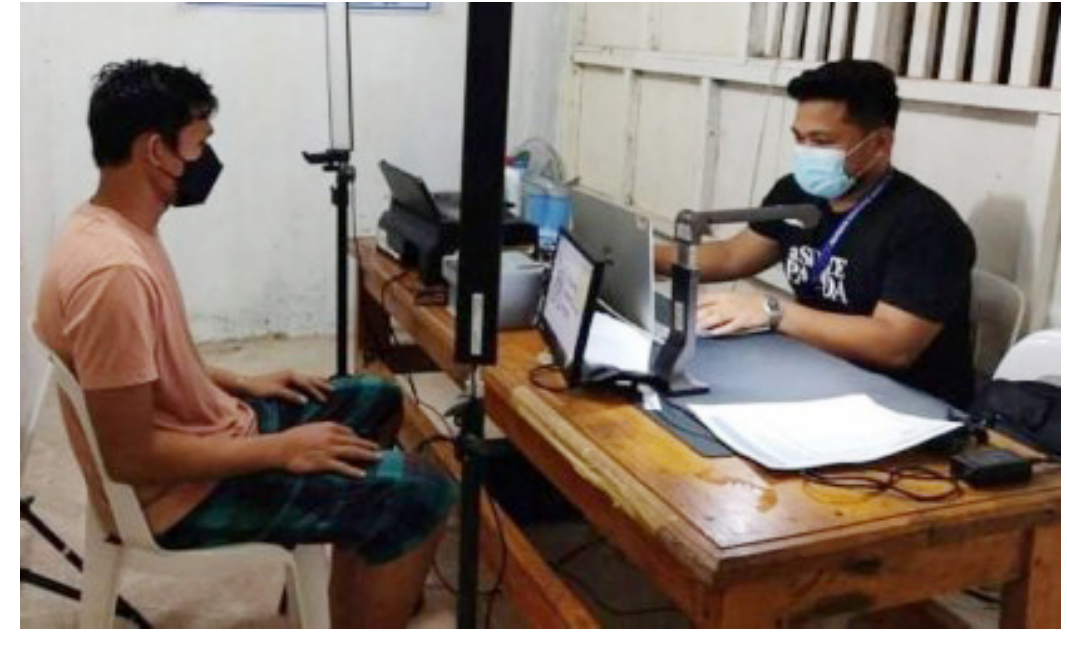
WAITING FOR THE CARD. A resident of Eastern Samar province enlists in the Philippine Identification System (PhilSys) in this undated photo. Only 20 percent of the over 3.3 million residents in Eastern Visayas who have registered for the Philippine Identification System (PhilSys) have received their printed identification (ID) cards, the Philippine Statistics Authority (PSA) reported on Wednesday (Aug. 10, 2022).

President Ferdinand Marcos Jr. has ordered the faster distribution of the national IDs under the PhilSys to enable Filipinos to use it by 2023.