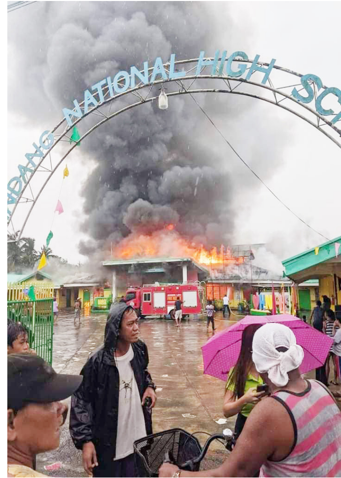
A two-hour fire consumed several structures of Hindang National High School on Sunday (August 14) morning with faulty electrical wiring seen as the possible cause of the conflagration.