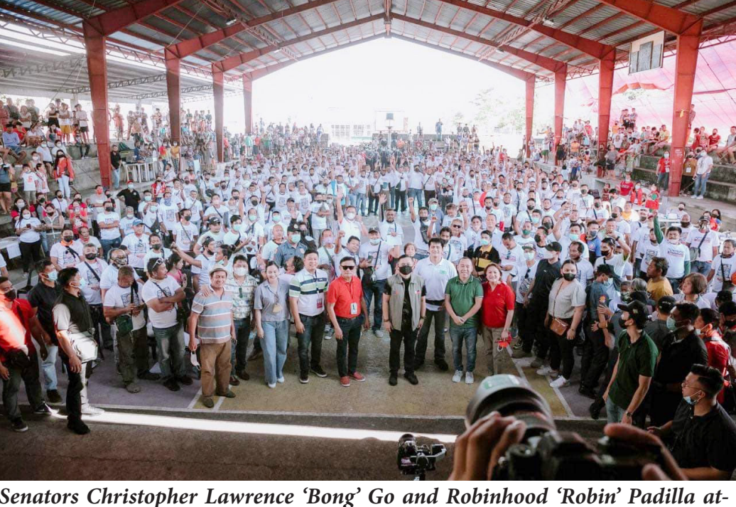
Senators Christopher Lawrence 'Bong' Go and Robinhood 'Robin' Padilla attended the 22nd founding anniversary of Maasin's cityhood last August 11. The two solons witnessed in the distribution of cash assistance to more than 300 public utility drivers. They were joined by local officials led by Governor Damian Mercado and Maasin City Mayor Naccional Mercado.