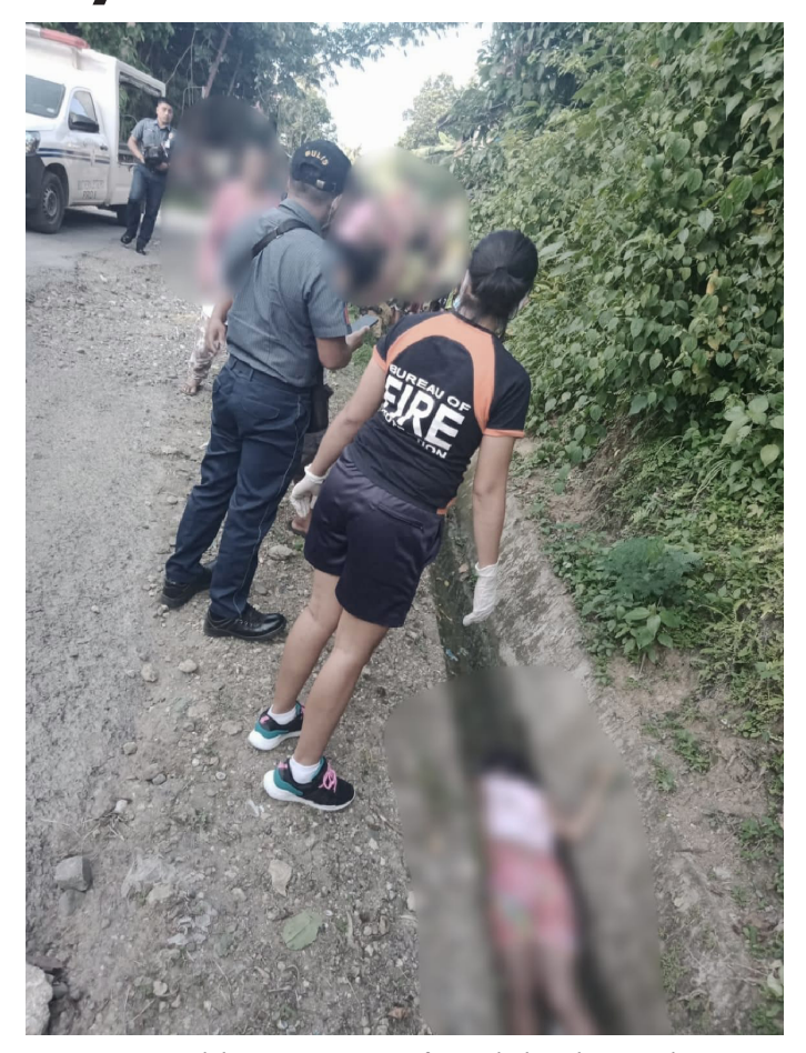
A 64-year old woman was found dead in a drainage canal in Macrohon, Southern Leyte last August 12. Probers ruled out any foul play on her death.

It was theorized that the victim threw the grasses she gathered during