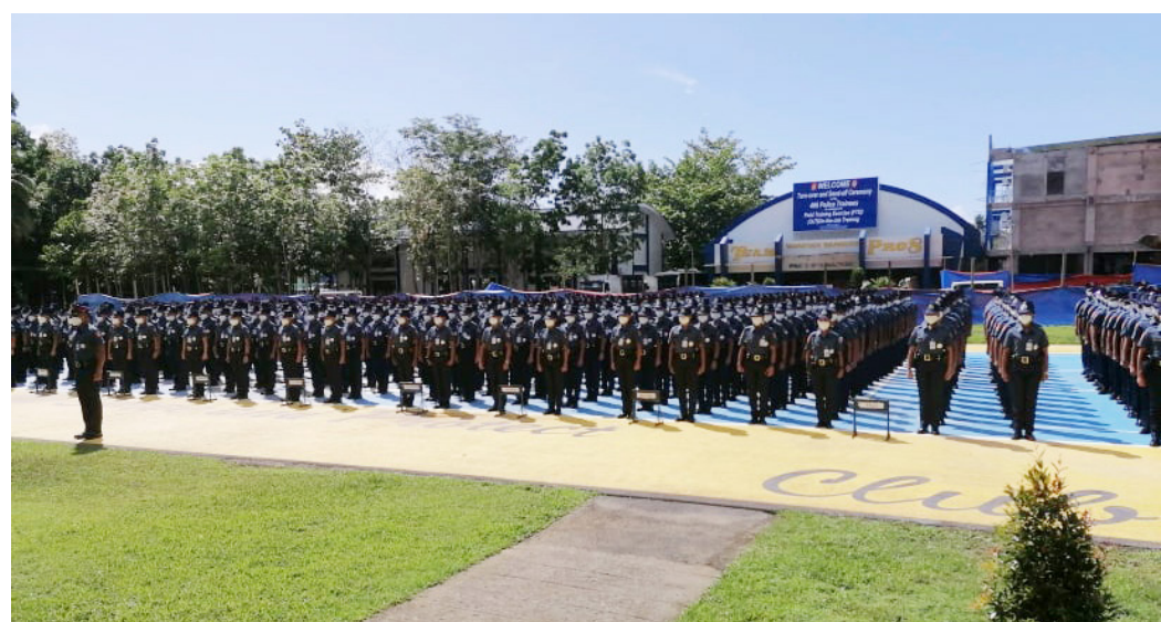
408 cops were deployed to police stations across the region to ensure the May 9 balloting will be orderly and peaceful.(PRO-8)

“As the elections become nearer, we are doubling our efforts to ensure the safety and security of the communities and the voting public. Expect that more uniformed men and women can be seen in all areas doing their task at hand,” he said.