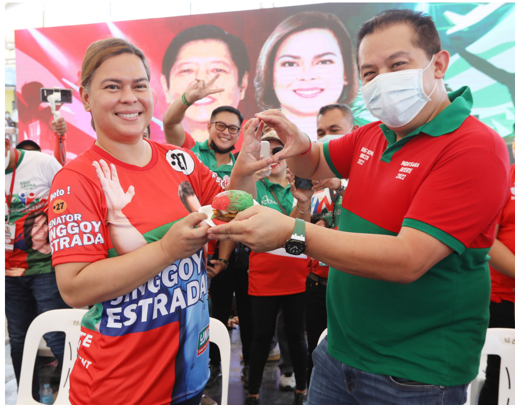
UNITEAM BURGER --- Lakas-CMD Vice Presidential Candidate and Davao City Mayor Sara Duterte with Lakas-CMD President and House Majority Leader Martin Romualdez shows to thousands of supporters the UniTeam burger color red and green during Grand Rally at Carmen Municipal Park Grounds in Davao Del Norte.