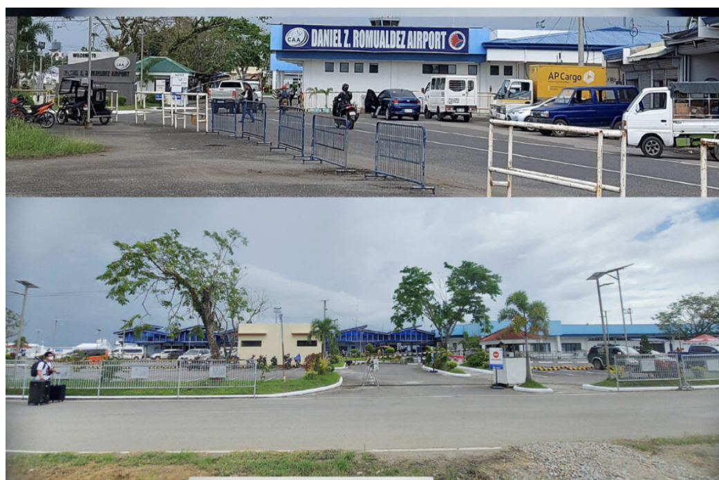
A meteostation was put up at the Daniel Z. Romualdez (DZR) Airport which could monitor local weather conditions of the city.

The Sansinirangan sends real-time information to people's mobile phones via a cloud applica-