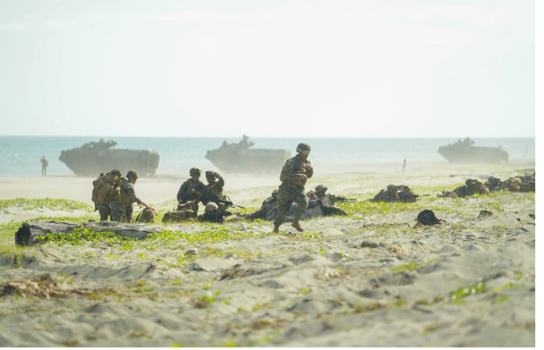
U.S. Marines with 3d Reconnaissance Battalion, 3d Marine Division and Philippine Marines with Force Reconnaissance Group conduct a close quarters battle range exercise at Marine Barracks Gregorio Lim in Cavite during Balikatan 22.