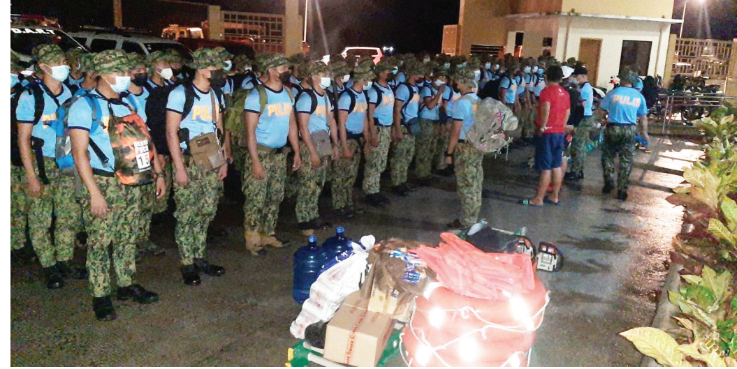
At least 200 police personnel from the regional PNP headquarters were deployed to help in the relief distribution, rescue and retrieval operations in areas devastated by 'Agaton.'PNP-8)

Police personnel in Eastern Visayas also conducted clearing operations and relief distributions. (ROEL T. AMAZONA