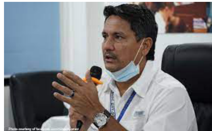
MAYOR RICHARD GOMEZ

"Unti-unti na pong nagbubunga ang ating mga sakripisyo at paghihirap. Sa ating paghahawak-kamay ay sama-sama nating napaganda muli ang Ormoc