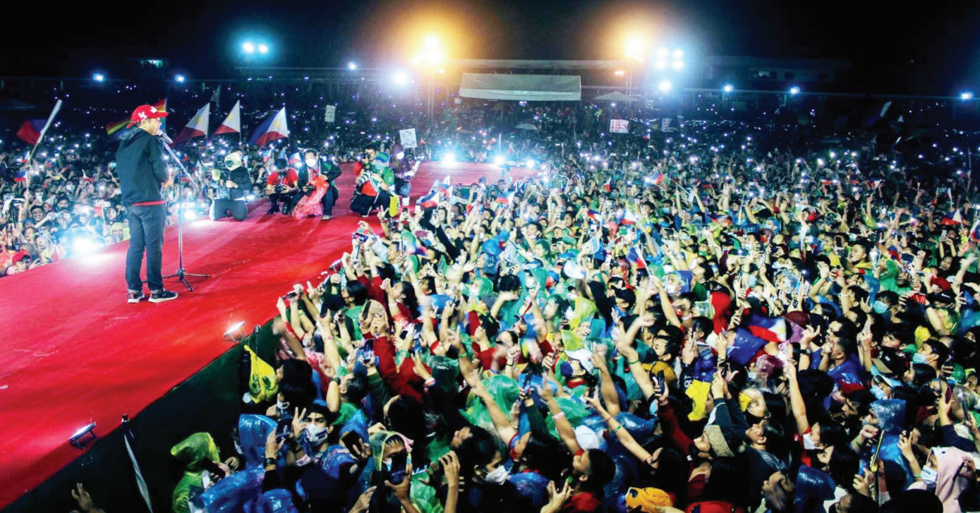
BBM. Former senator and presidential aspirant Ferdinand "Bongbong" Marcos, Jr. was overwhelmed with the throng of his supporters who attended the UniTeam rally held at the Leyte Sports Complex, Tacloban City, last Saturday (April 9) despite of heavy rains spawned by tropical depression 'Agaton'. Organizers of the rally reported that 210,000 people attended the rally, making the biggest ever in the region.