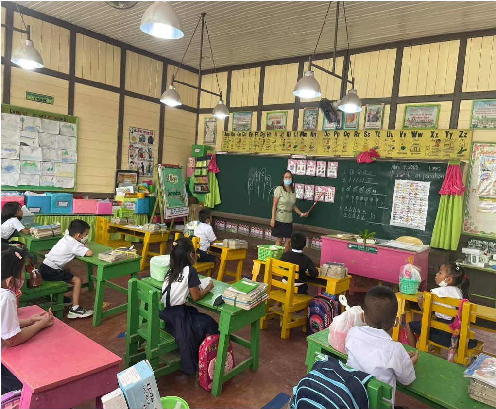
The Department of Education in Leyte announces that 967 public and private schools across the province are now holding in-person classes with more schools expected to conduct face-to-face classes with the declining COVID-19 cases. Photo shows students at the Leyte Central School in Leyte, Leyte attending the limited in-person classes. (RENANTE C. DELIMA)