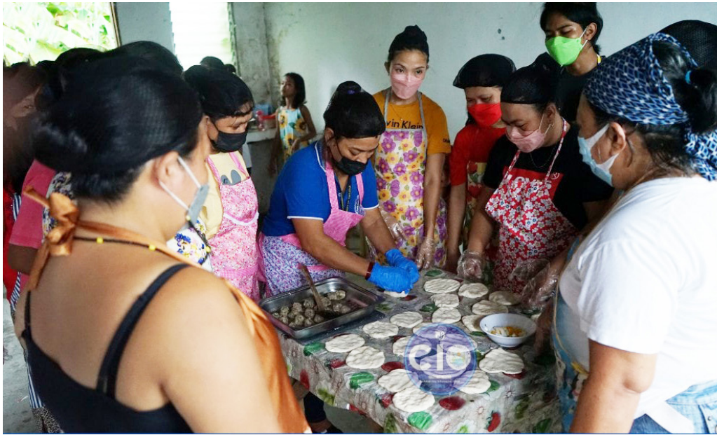
The Tacloban city government under Mayor Alfred Romualdez continues to extend livelihood assistance to residents in the northern part of the city like those in Guadalupe and New Hope for them to earn income, especially during this time of pandemic.(TCIO)

TACLOBAN CITY- To cater to the residents in the northern part of this city, the Comprehensive Livelihood and Extension Program (CLEP) of the local government made its way by offering various courses in some resettlement areas. Seeking to uplift the city's economy by empowering constituents and providing opportunities to augment their incomes amid the pandemic, the city government under Mayor Alfred Romualdez served interested beneficiaries with short training courses such as food processing, baking, reflexology, and dressmaking, among others. Beneficiaries include mothers, grandmothers, and youth, residing in Guadalupe and New Hope and