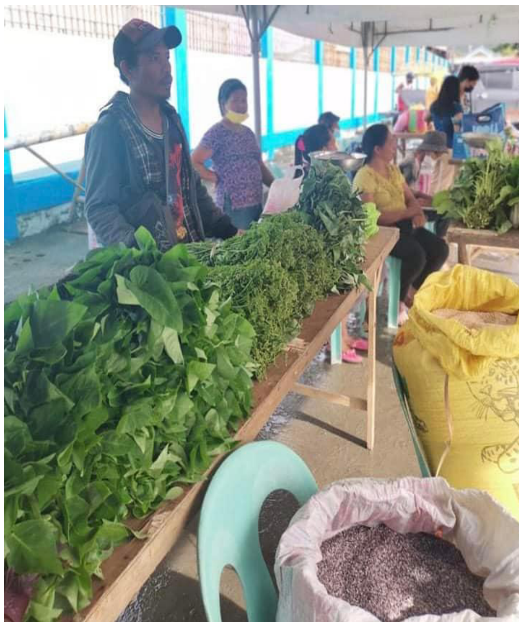
The city government in Catbalogan initiated a weekly market day which aims to help local fishermen and farmers sell their produce.

The city mayor is thankful for the assistance from various departments of the city government which include the Catbalogan City Agriculture Office, Catbalogan City Economic Enterprise and Public Utility Office, Catbalogan City General Services Office, and Catbalogan City