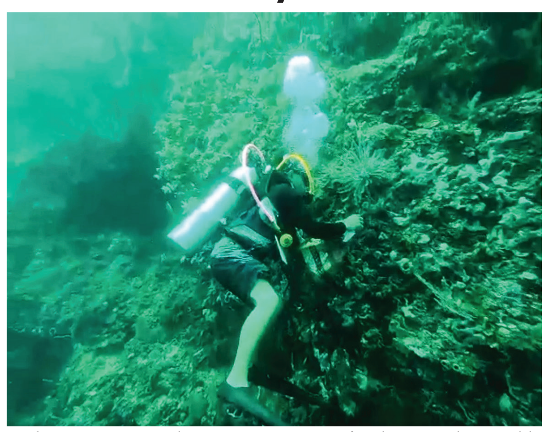
As diving resorts in Southern Leyte are to open after these were devastated by Typhoon 'Odette,' they are calling for diver volunteers to help them revive the industry.

ing this month and will be welcoming foreign tourists starting this April.