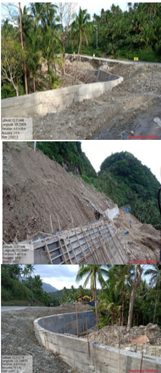
in the mountain ranges in the Pacific Towns of North-

(Note: In order to be factual about the above ‘delicate information,’ this Columnist directly quoted most of the writings of PhilStar’s Columnist Federico Pascual’s Postscript article, dated 6 FEB 2022; only revising some words to suit the printing/posting limitations. - Q)