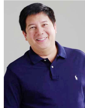
Mayor Alfred Romualdez