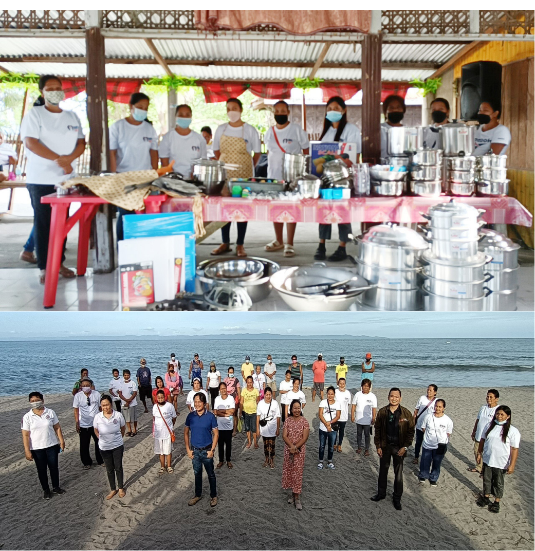
DOT-8 has turned over start-up kits to three people's organizations in Brgy. Bislig, Tanauan, Leyte.