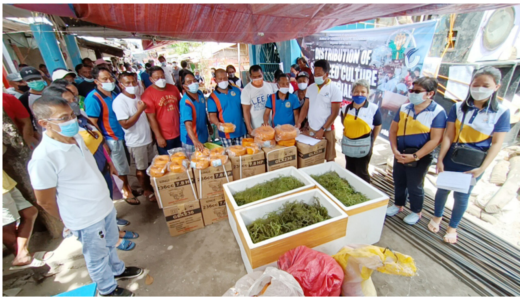
BFAR-8 turned over P1.2 million worth of assistance to seaweeds farmers in Dawahon, Bato. BFAR said that assistance aim to help the fishing and seaweeds farming community after their main source of livelihood was destroyed by Typhoon 'Odette'.