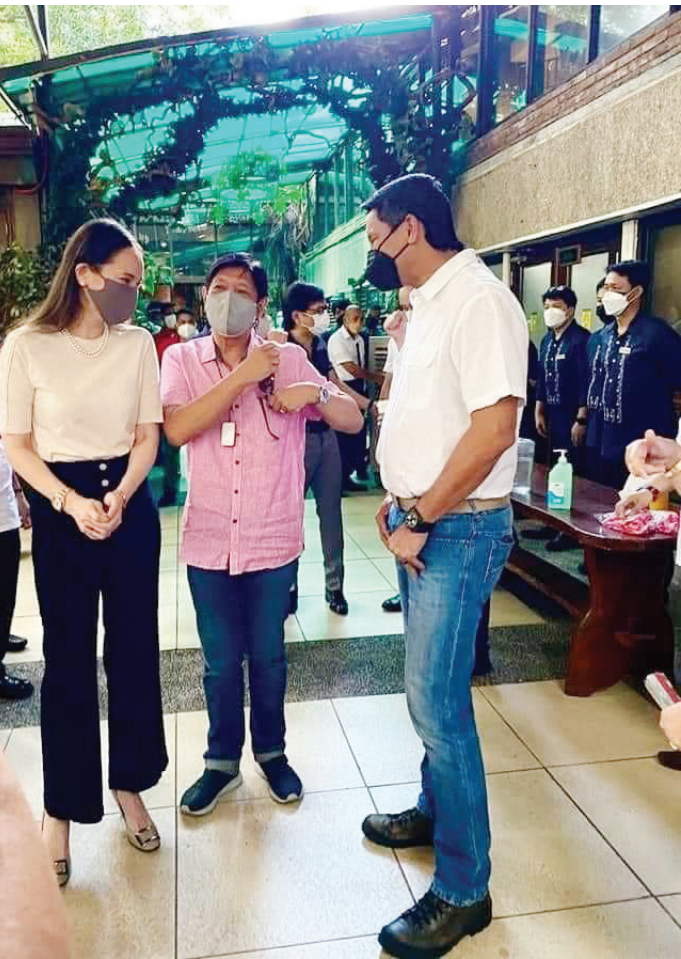
SUPPORT. Former senator Ferdinand 'Bongbong' Marcos, Jr. is the presidential candidate for power couple Ormoc City Mayor Richard Gomez and Leyte Rep. Lucy Torres Gomez. The lady solon had earlier said that Marcos has provided Ormoc assistance when it was pummeled by Super Typhoon 'Yolanda' almost nine years ago.