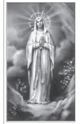
Pray the Holy Rosary daily for world peace and conversion of sinners (The family that prays together stays together)

Well, as a Facebook & Video surfer, this Colum-