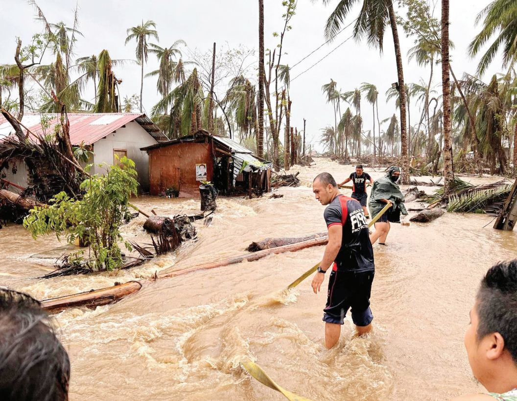
CALAMITY. As Southern Leyte is still reeling from the impacts of the onslaught of typhoon 'Odette,' heavy rains spawned by shear line and 'amihan' or northeast monsoon has hit the province over the weekend. Photo shows personnel from the Bureau of Fire Protection from the towns of Libagon and Saint Bernard conducting their rescue efforts to residents hit by the flooding.