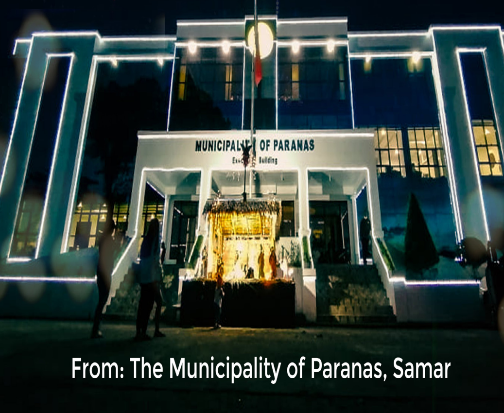
From: The Municipality of Paranas, Samar