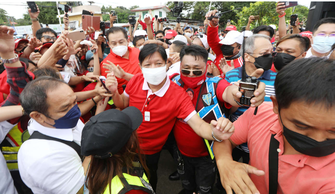
Presidential candidate and former Senator Ferdinand Bongbong Marcos Jr assisted by Lakas-CMD Party President and House Majority Leader Martin Romualdez crossed the sea of supporters during their visit at Barangay Basak Lapu Lapu City Cebu.