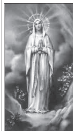
Pray the Holy Rosary daily for world peace and conversion of sinners (The family that prays together stays together)