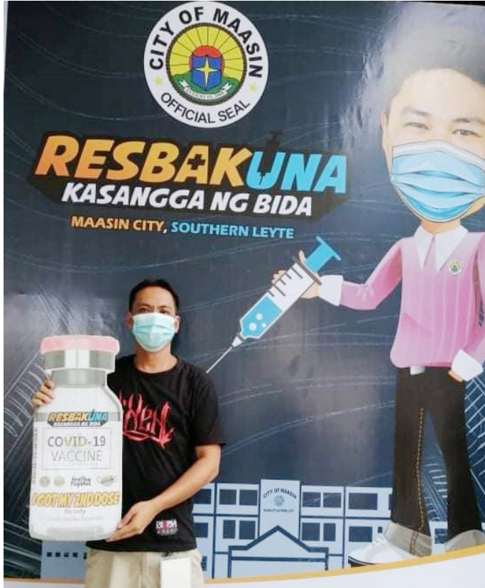
The city of Maasin is on track to achieve herd immunity before the end of the year, says its mayor Nacional Mercado. Maasin has over 20,800 fully vaccinated individuals.

is when herd immunity is achieved. The support from local government units and local chief executives is also vital in the demand generation of the COVID-19 vaccination, regardless of vaccine brand,” the Department of Health-Eastern Visayas said.