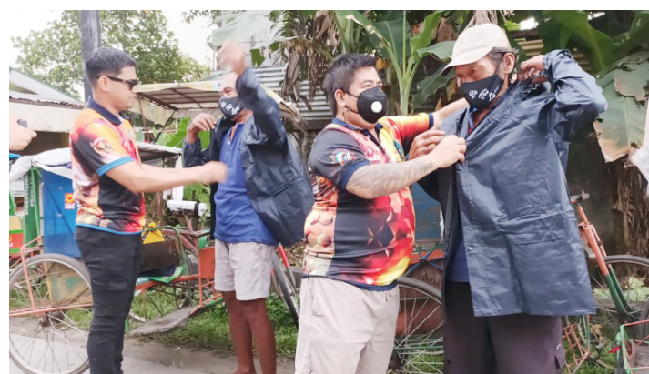
Some 40 pedicab drivers from Tacloban City received raincoats and washable facemasks from Central Kanhuraw Eagles Club.

According to the group, the raincoats could help pedicab drivers to protect themselves during this time of rainy season and the facemask could protect them from the dangers of coronavirus disease (COVID-19).