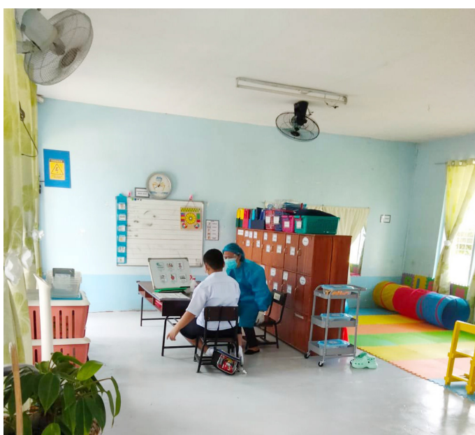
The Palo I Central School in Palo, Leyte is among the 10 public schools in the region to join the pilot testing of the face-to-face classes which started on Monday (Nov.15). The school has two students who are enrolled of its special education classes for the pilot testing of face-to-face classes.