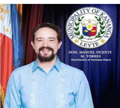
MAYOR MANUEL VICENTE ‘MATT’ TORRES

Torres said that the income generating department of the local government is doing their best to