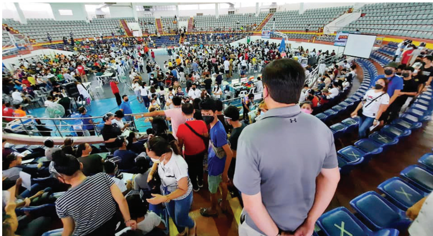
CLOSE MONITORING. Tacloban City Mayor Alfred Romualdez personally sees the progress of the vaccination drive in the city as Tacloban starts its vaccination campaign for children aged 12 to 17. Over 26,000 of this age bracket are targeted to be vaccinated in Tacloban City.