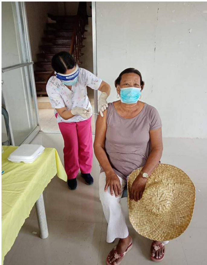
The remote town of Maslog in Eastern Samar, while encountering several challenges, has now achieved more than 50 percent of its target population of its vaccination campaign, says its top medical doctor.