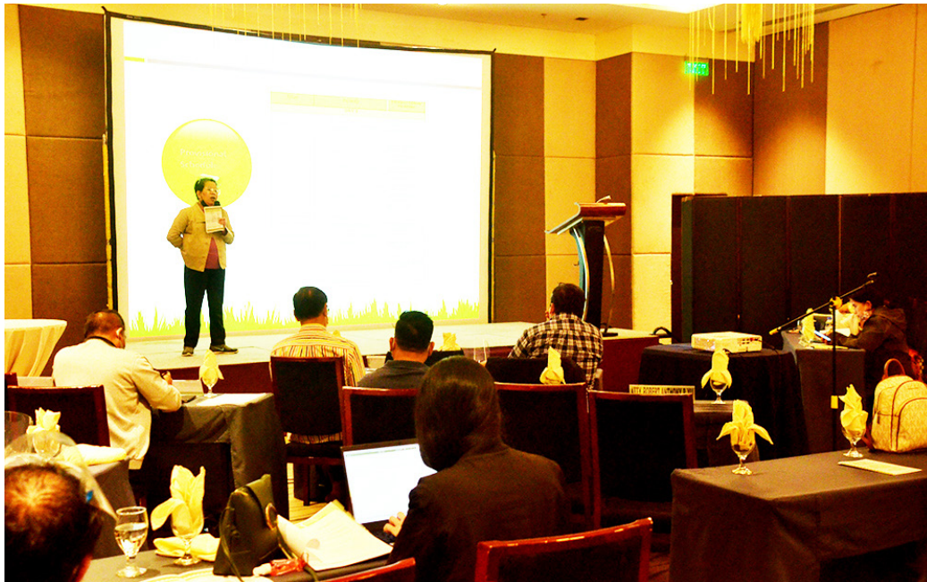
The Department of Agrarian Reform (DAR) Eastern Visayas hosted in October the conduct of “Policy Orientation on the Revised Guidelines and Procedures on the Parcelization of Landholdings with Collective Certificates of Land Ownership Award” to participants from Regions VII and VIII to fast-track the issuance of individual titles.