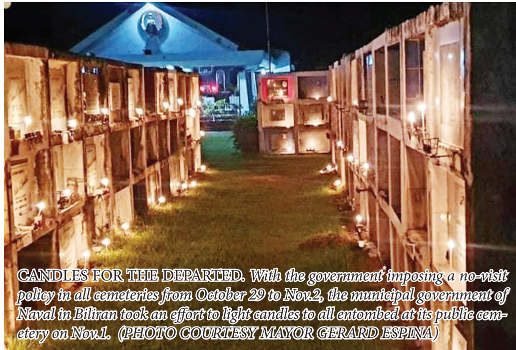
CANDLES FOR THE DEPARTED. With the government imposing a no-visit policy in all cemeteries from October 29 to Nov.2, the municipal government of Naval in Biliran took an effort to light candles to all entombed at its public cemetery on Nov.1.