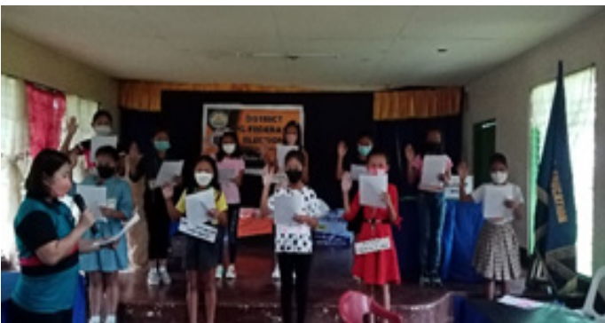
Oath taking Ceremony

“Leadership is not a position or a title, it is action and example” from an unknown author.