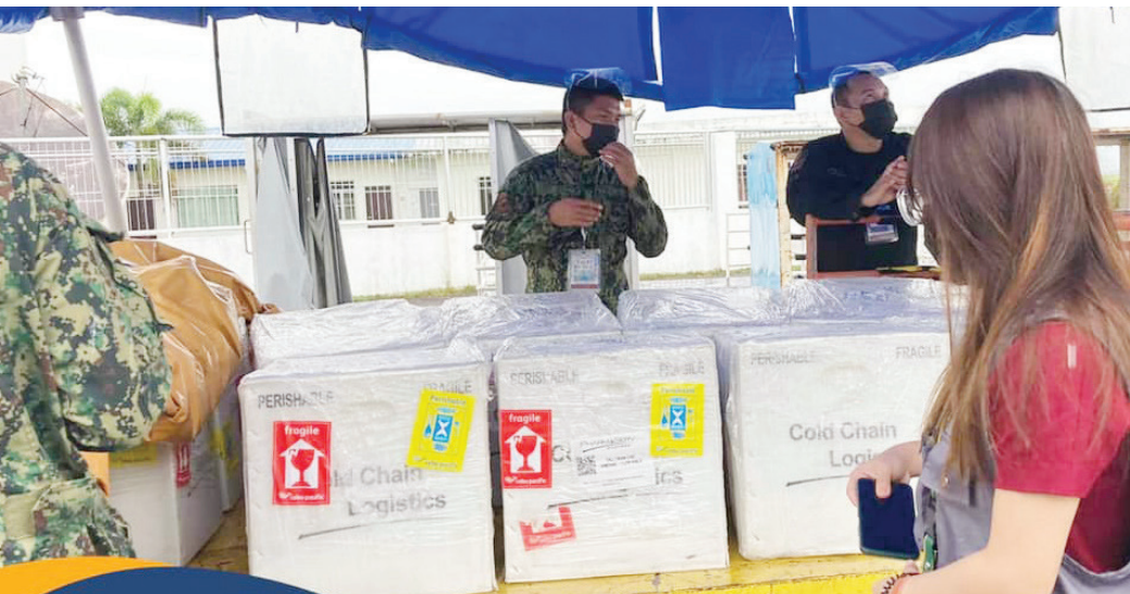
SCALING UP. While Eastern Visayas cases of coronavirus disease (COVID-19) appear to decline, the Department of Health is urging the local government units (LGUs) in the region to scale up their vaccination campaign to attain herd immunity by December this year. The DOH says they have enough vaccines ready for distribution to various LGUs. The region has so far received over 2 million doses of vaccines.

As it races to attain herd immunity by December