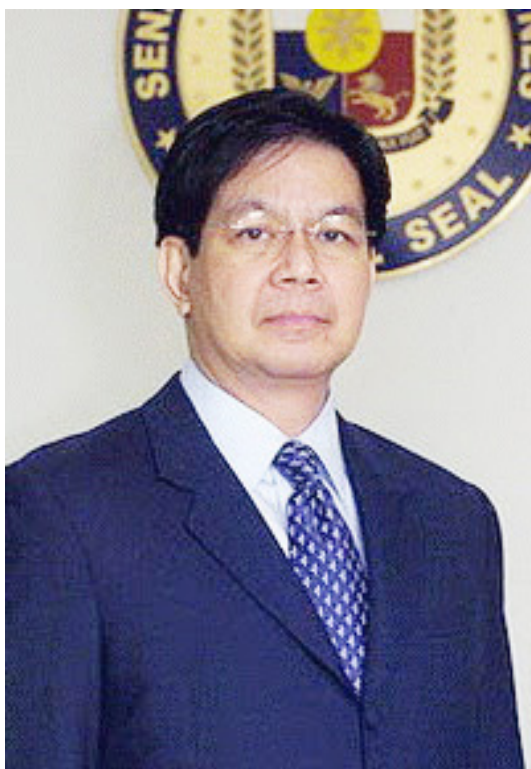
SENATOR PANFILO LACSON

Presidential candidate, Senator Panfilo Lacson is pushing for zero-billing in government hospital, most especially for indigent patients.