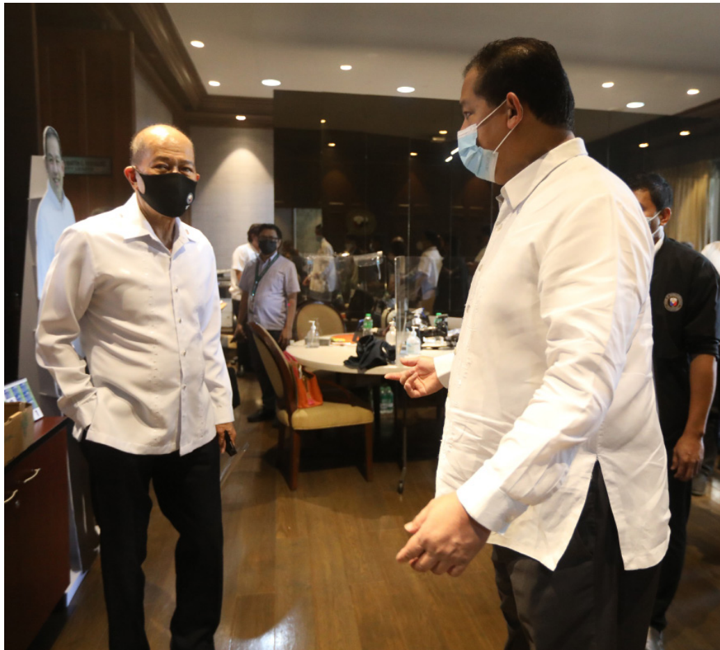
House Majority Leader and Leyte Rep Martin Romualdez (right) warmly welcome to his office the Secretary of National Defense Delfin Lorenzana (left) during a courtesy call and short meeting before the 2022 Budget Deliberation of the DND at the plenary of the House of Representatives.

Last day to publish the Approved List of Nominees.