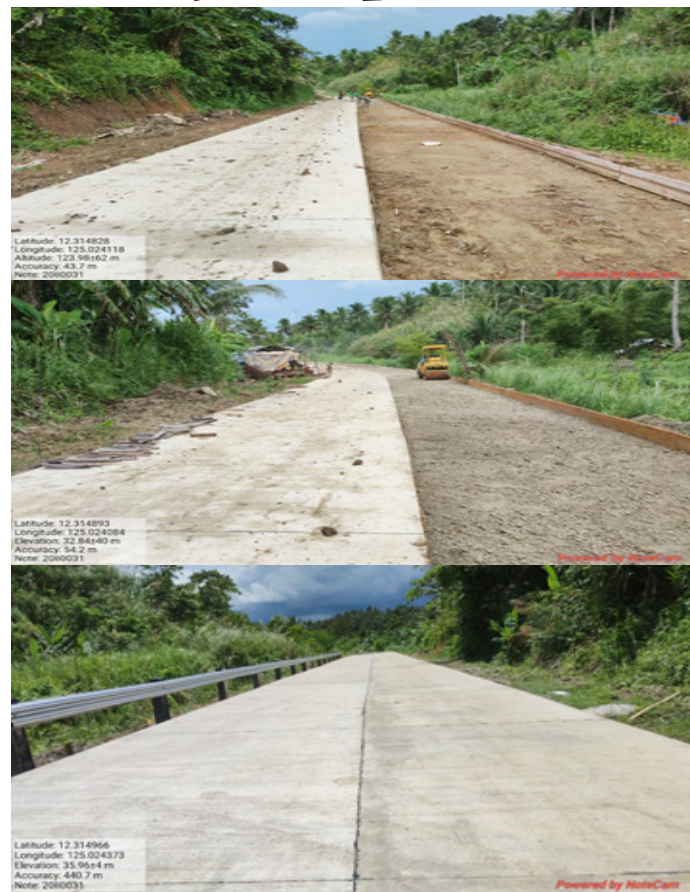
Access Road leading to Tourist Destination (Pinipisakan Falls) Phase 4, located at Brgy. San Isidro, Las Navas, Northern Samar.

This additional 3.400 lane kilometers access road leads to the famous Pinipisakan Falls that