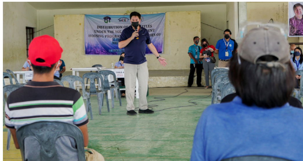
Tacloban City Mayor Alfred Romualdez committed for the construction of more facilities at the city north for families living at the Yolanda resettlement sites for them to have a better living condition. Photo shows Mayor Romualdez during the giving of titles to 222 beneficiaries of the housing project last Sept. 23.