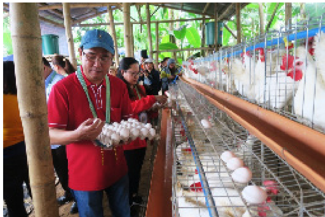
Egg production in Leyte is thriving due to the aggressive campaign of the provincial government under the More Income in the Countryside (MIC) project of Governor Leopoldo Dominico Petilla (shown in the photo) who provided assistance to more than 100 associations which are into egg laying production.

Under this, FAs are granted with 1,440 heads of ready to lay chickens with