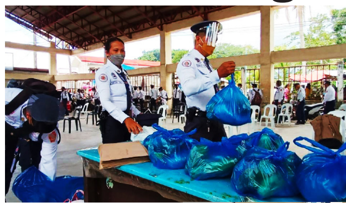
Campetic in Palo town.

The activity was held last Wednesday (Sept.29) at the covered in Barangay