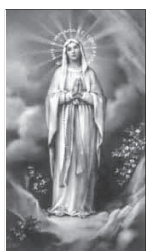
Pray the Holy Rosary daily for world peace and conversion of sinners (The family that prays together stays together)