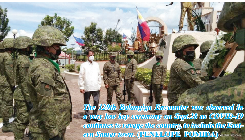
The 120th Balangiga Encounter was observed in a very low key ceremony on Sept.28 as COVID-19 continues to ravage the country, to include the Eastern Samar town. (PENELOPE POMIDA)

TACLOBAN CITY- The 120th anniversary of the Balangiga Encounter was remembered on Tuesday (Sept.28) without much fanfare with its main guest, Senator Cynthia Villar delivering her