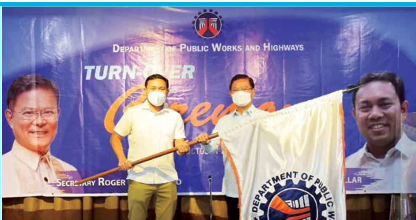
NEW DPWH SECRETARY. Southern Leyte Rep. Roger 'Oging' Mercado(right) was named as the new secretary of the Department of Public Works and Highways replacing Mark Villar who stepped down as he is seeking for a Senate seat in next year's polls. The turnover was held last Thursday (Oct.14) at the DPWH central office in Manila. Story on page 2

Leyte and Southern Leyte, which will be electing two congressional representatives for the