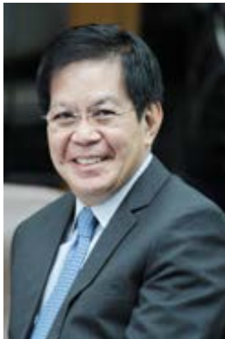
Senator Ping Lacson

non-transparent procurement of Sinovac vaccines, and the investigation into the controversial DOH deal with Pharmally Pharmaceutical Corp.