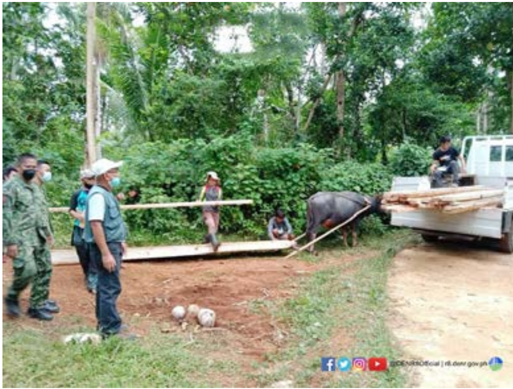
More than 200 board feet of hot logs were confiscated in Barangay Talahid, Almeria in Biliran province by the personnel of the Provincial Environment and Natural Resources Office (PENRO)-Biliran and the local police.

serious in its campaign against timber poaching. To strengthen our campaign, we are closely coordinating with different barangays, LGU officials, and other law enforcement agencies," he said.