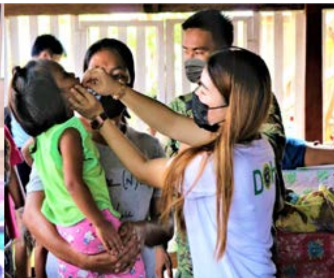
Residents from sitios Pala-uno and Karuyagon of Barangay Putong in San Julian, Eastern Samar benefited the ‘serbisyo caravan’ initiated by the 78th Infantry Battalion in coordination with the municipal government held on October 12.

TACLOBAN CITY- The Philippine Army’s 78th Infantry Battalion (IB) and the municipality of San Julian in Eastern Samar joined hands in bringing medical and social services to 77 families in the isolated sitios of Pala-uno and Karuyagon in Barangay Putong of the said town on Tuesday (October 12).