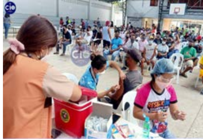
Over 200 pedicab drivers in Tacloban City are now fully vaccinated as they received their second dose on Wednesday (Oct. 13). The inoculation of the drivers against COVID-19 is part of the mobile vaccination drive of the city government under Mayor Alfred Romualdez.

TACLOBAN CITY- More than 200 pedicab drivers from this city are now fully vaccinated against the coronavirus disease (COVID-19).