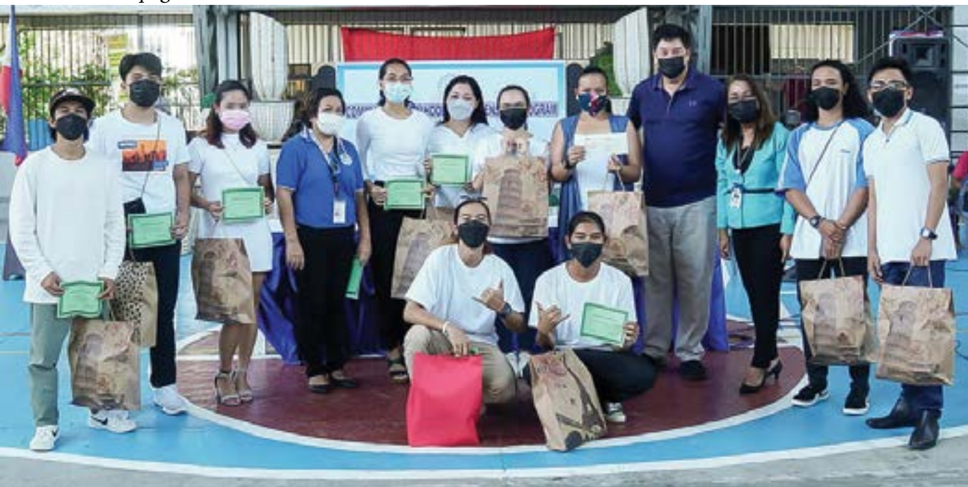
Tacloban City Mayor Alfred Romualdez expressed his gratitude to the 90 residents of the city who completed a 15-day training on food processing under the Community Livelihood and Extension Program (CLEP) of the city government held last Sept.23. Aside from receiving certificates of completion and starting kits, the beneficiaries of the program also received P5,000 financial assistance from the city mayor.