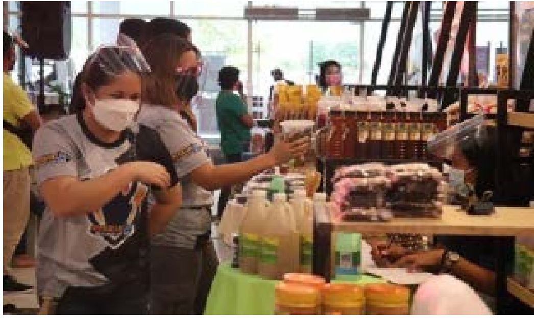
TRADE FAIR. Buyers visit the Bahandi Trade Fair at Robinsons Place Tacloban in this Sept. 18, 2021 photo. The first face-to-face Eastern Visayas regional trade fair held this pandemic has surpassed its sales target, benefitting 41 micro small and medium enterprises in the region, the Department of Trade and Industry reported on Wednesday (Sept. 22).

“There were 1,000 individuals who were vaccinated each day. After their vaccination, people tend to drop by the trade fair,” Bato told the