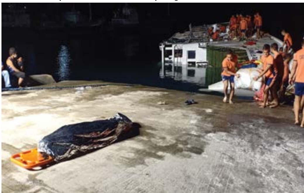
SEA MISHAP. A female crew of the MV Lite Ferry 3 died while 15 others survived in a sea tragedy off the waters of the Ormoc City wharf last Saturday early morning. The vessel was from Cebu and was only loaded with its crew members and cargos.