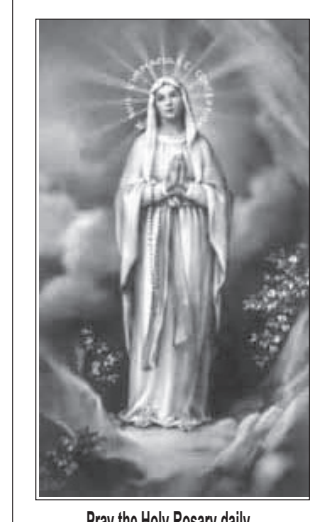
Pray the Holy Rosary daily for world peace and conversion of sinners (The family that prays together stays together)

Without faith, in spite of our keenest intelligence, we will miss much of the more important aspects of our life as we would only be restricted to the here and now, the material and the temporal.