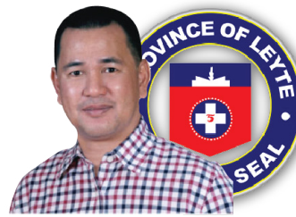
Governor Leopoldo Dominico Petilla

PALO, Leyte - The province of Leyte will continue to maintain its lead as a rice producer in the region.