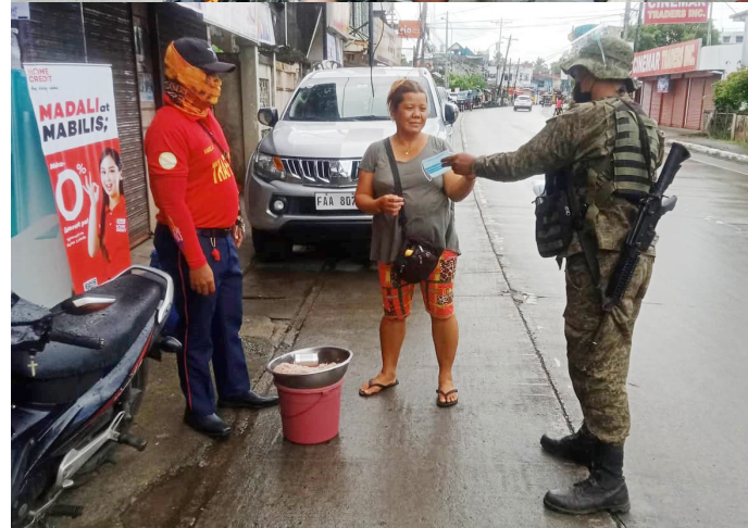
Personnel of the 78th Infantry Battalion assists the City Traffic Operation Office and other uniformed personnel in Borongan City in the implementation of minimum health protocols as the city was placed under Modified Enhanced Community Quarantine.

providing leisure and entertainment are temporary suspended while the city is under MECQ.