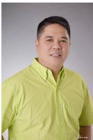
Gov. Edwin Ongchuan

The provincial government has around 3,000 employees to include the contractuels.