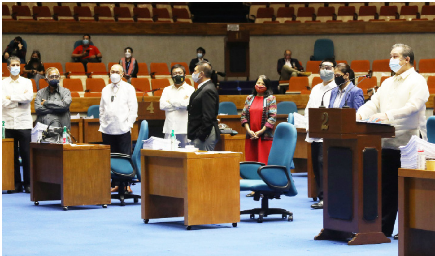
House Majority Leader and Leyte Rep. Martin Romualdez delivered his speech during the sine die adjournment at the plenary of the House of Representatives. Romualdez said House Speaker Lord Alan Velasco approved his motion to allow all standing and special committees to hold hearings during the congressional recess this month until resumption in July 26 for the opening of the Third Regular Session and the final State of the Nation Address (SONA) of President Rodrigo “Roa” Duterte.

Had this been a good war that they had been waging against the government, like resisting the ruthless Japanese invaders before, their harming of civilians could perhaps be justifiable. But they are fighting for a foreign, anti-Pilipino ideology that is against democracy, freedom, God, family values, human dignity, and other virtues that we hold so dear.