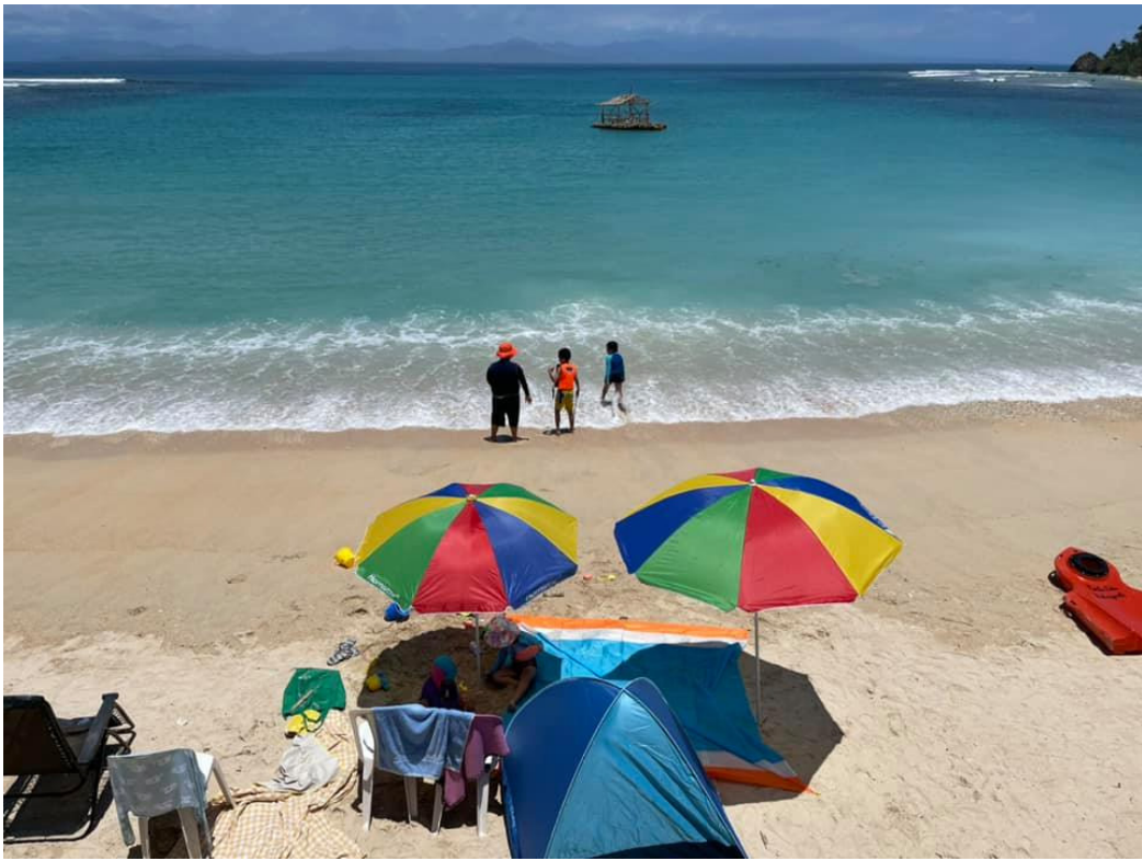
The move of the Allen municipal government to place Barangay Cabacungan would mean closure of the famous Caba Beach Resort to avoid any mass gathering as the entire province of Northern Samar is experiencing a surge of COVID-19 cases.

"After due consultation with local officials, law enforcement agencies, chief of offices, medical and health professionals, and experts, the MIATF, there is an urgent need to implement a granular 14-day lockdown and containment of Caba beach, Barangay Cabacun-