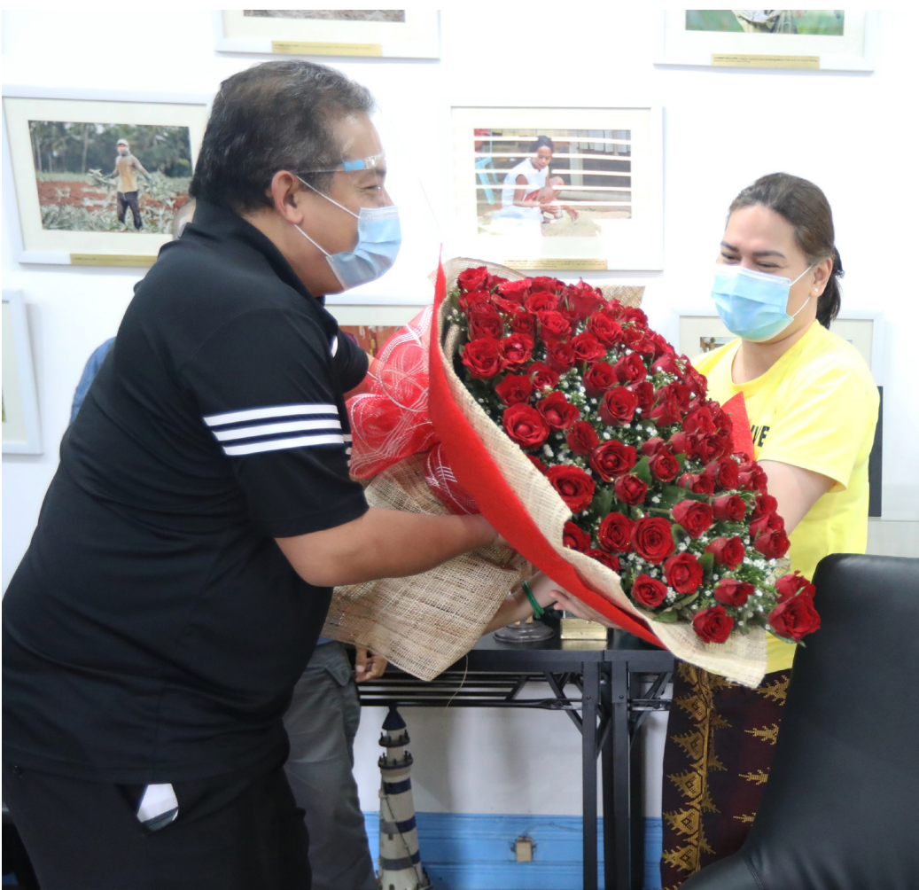
House Majority Leader and Leyte Rep. Martin Romualdez (left) greets Davao City Mayor Sara Duterte a happy birthday with a bouquet of flowers during his visit at Davao City Hall. Romualdez assured that Lakas-CMD Party will support Mayor Duterte whatever she plans in the future.