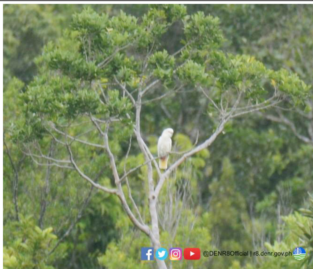
A Philippine cockatoo was recently seen in Homonhon Island off Guiuan town in Eastern Samar. The bird is considered to be critically endangered with an estimated 1,000 could be found mostly in Rasa Island.

With the support of the Philippine Misereor Partnership Incorporated (PMPI), the DENR has been collaborating with the LGU of Guiuan in Eastern Samar and the BLGU of Inapulangan of Homonhon Island for the area to be declared as a critical habitat based on DENR Memorandum Circular 2007-02 which provides the guidelines on the establishment and management of critical habitat enumerated in DENR Memorandum Circular No. 2007-02. (PR)