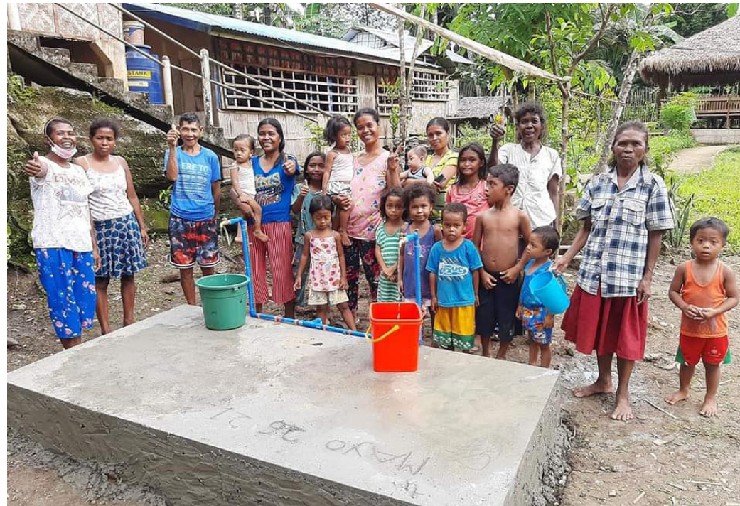
Fear on possible adverse effects is the reason why the Mamanwas living in Basey, Samar, are not yet ready to receive any vaccines against coronavirus disease (COVID-19).