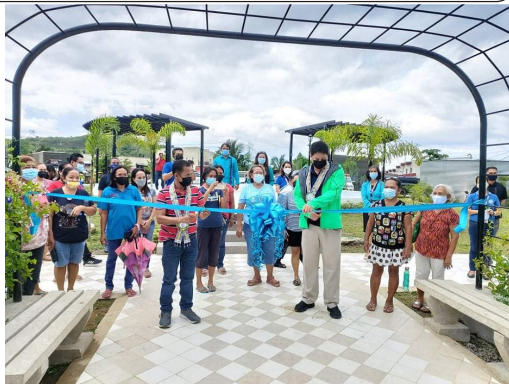
Tacloban City Mayor Alfred Romualdez led the inauguration of a family park located in Barangay 106(Santo Nino). The facility, where settlers at various resettlement sites at the northern part of the city can enjoy, is also part of the greening program of the city government.

Mayor Romualdez, who led the inauguration activity, in his message, asked the residents and