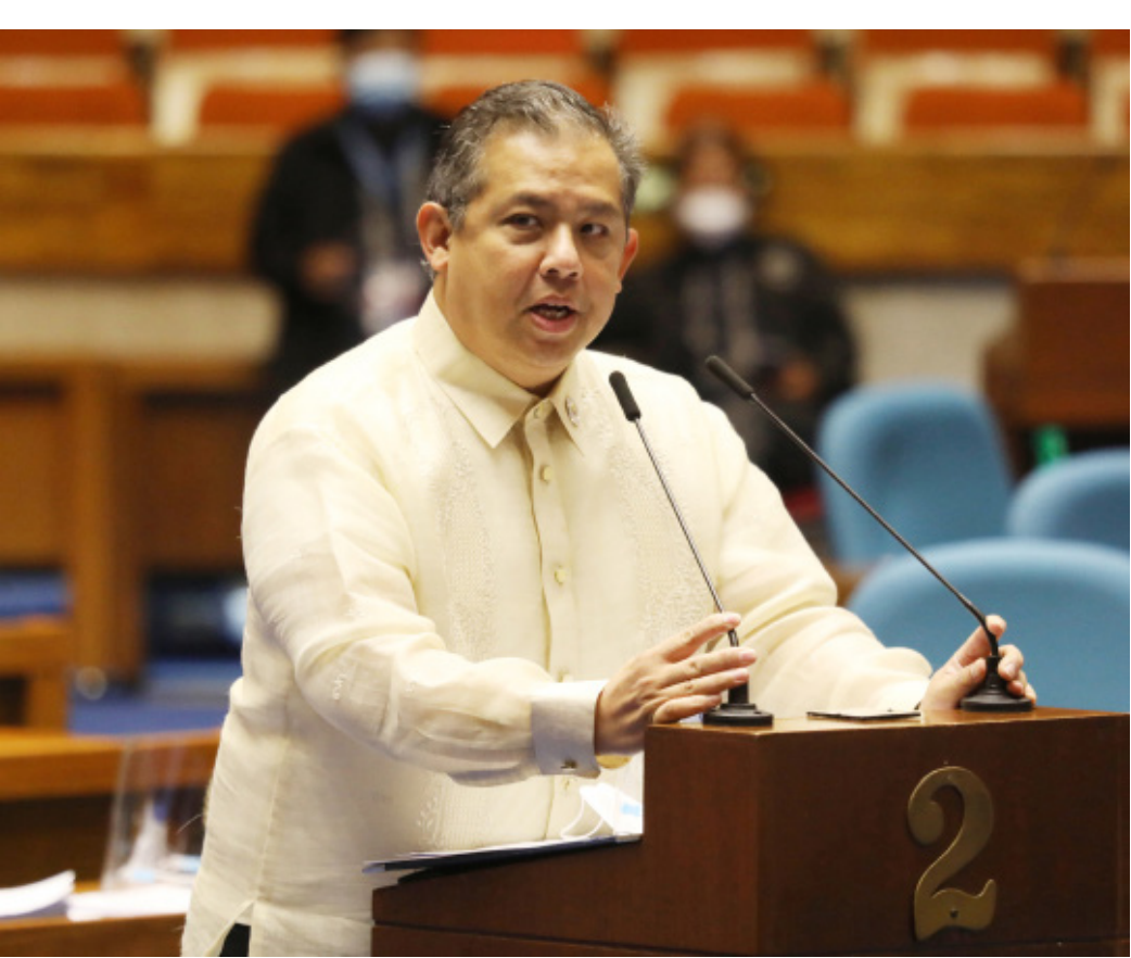
House Majority Leader and Leyte Rep. Martin Romualdez lauded the Biden administration's support to international efforts suspending intellectual property protection rules for COVID-19 vaccines, calling it a moral move that will ensure humankind's survival.