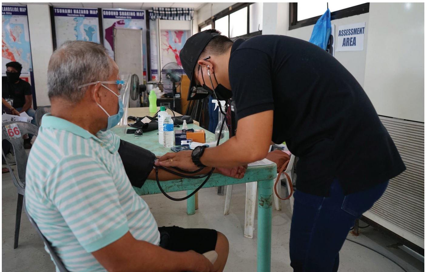
VACCINATION. With the region experiencing a surge of the coronavirus disease (COVID-19), the Department of Health is renewing its call for all qualified individuals to submit themselves for inoculation as their defense against the virus. The DOH reported that there were medical workers who get the infection though they have already received the vaccines. (TACLOBAN CITY INFORMATION OFFICE)