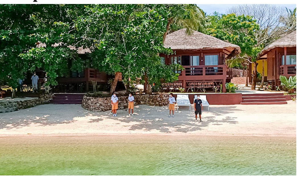
A luxury resort located in San Vicente, Northern Samar has open which aim to cash in on tourism dollars as it offers world class services and amenities.