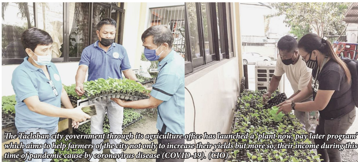
The Tacloban city government through its agriculture office has launched a 'plant now, pay later program' which aims to help farmers of the city not only to increase their yields but more so, their income during this time of pandemic cause by coronavirus disease (COVID-19). (CIO)

TACLOBAN CITY- The Office of the City Agriculturist has recently launched the 'Plant Now, Pay Later Program', a farming assistance scheme which aims to assist the registered farmers associations of Tacloban City, as well as individuals who are members of these associations.