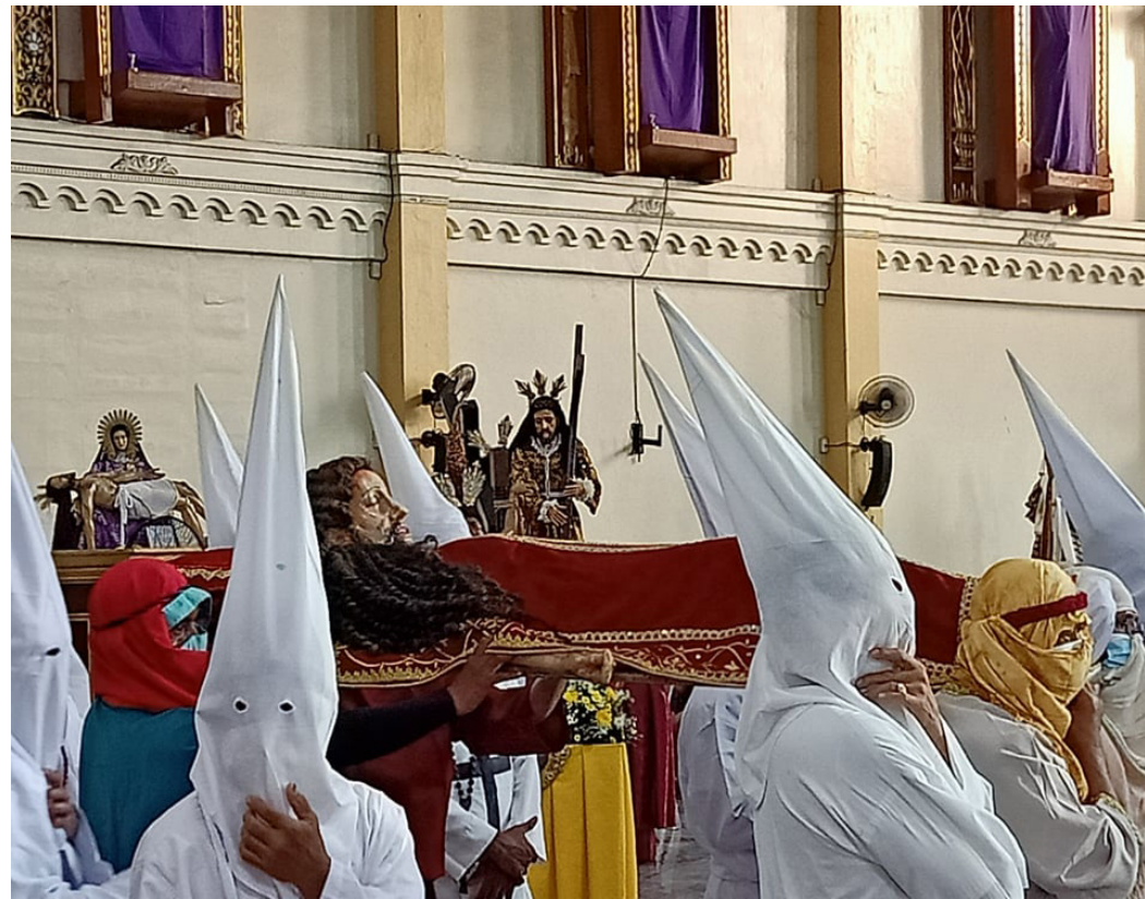
The decades-old presentation on the passion and death of Jesus Christ held at Palo, Leyte continues despite of the raging health pandemic cause by the coronavirus disease. Photo shows the ‘penitentes’ carrying the Santo Entierro.

“The pandemic prevented the leaders (mentor-formators) from conducting activities such as chapel visitation, outreach (social action) activities and the like as part of their formation in the faith and in the brotherhood,” Monsignor Urbina added.