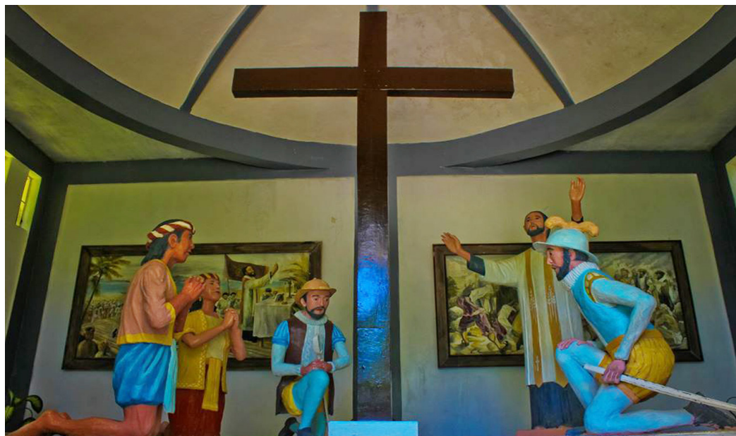
A tableau which depicts the First Mass presided by Fr. Pedro Valderrama is the center piece of the Magellan Shrine.

"It really symbolizes that Limasawa is where the First Mass was held aside from the fact that we know in our hearts that it serves as our protector from calamities