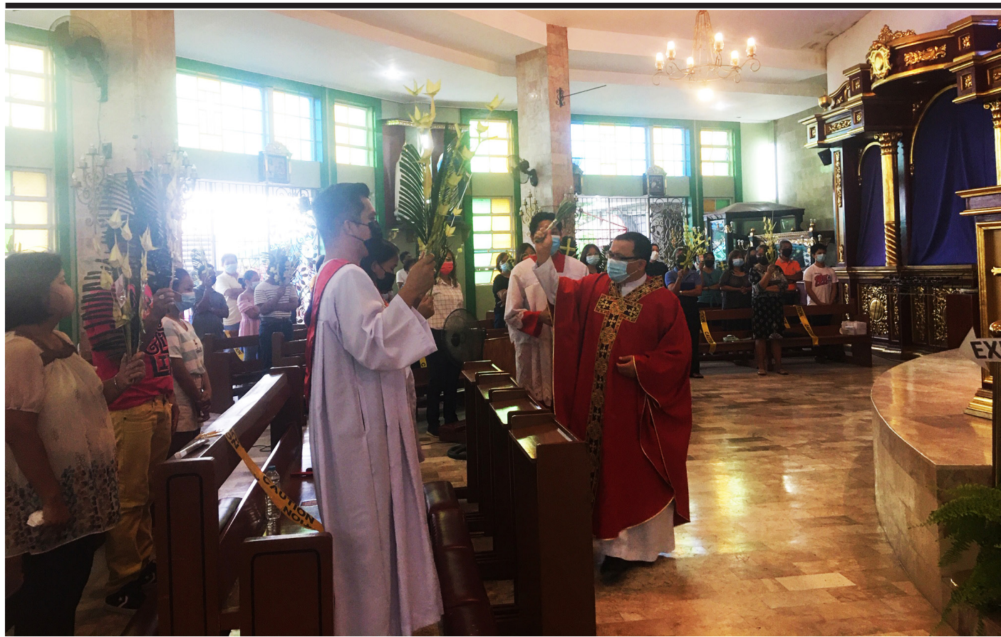
PALM SUNDAY. The observance of the Holy Week starts with the Palm Sunday feast which marks the triumphant entry of Jesus Christ to Jerusalem. Photo shows faithful have their palm fronds blessed by the priest during the mass held last Sunday (March 28).