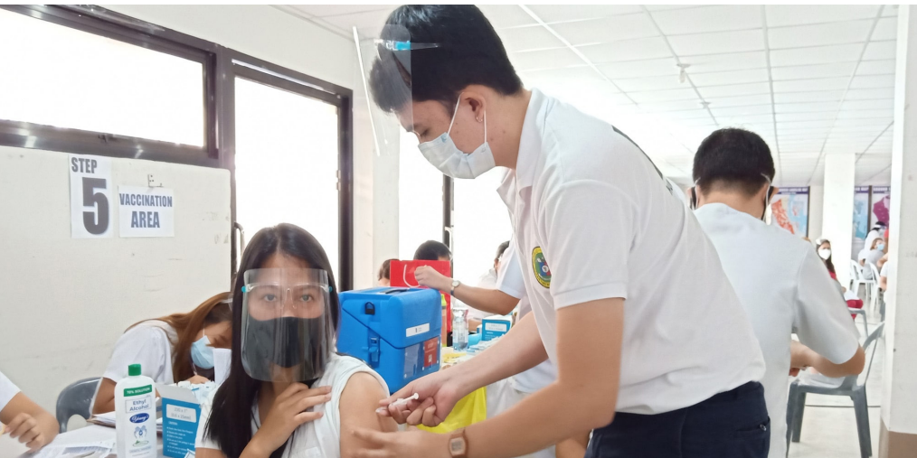
The city government of Tacloban continues its vaccination campaign for its healthcare workers and other frontliners with the city's over 18,000 senior citizens next in line for the inoculation.

TACLOBAN CITY- More healthcare workers and frontline government personnel are expected to receive the anti-COVID shots using the AstraZeneca brand as the city continues its vaccination program today (March 29) at Tacloban City Training Center (US-AID Building).