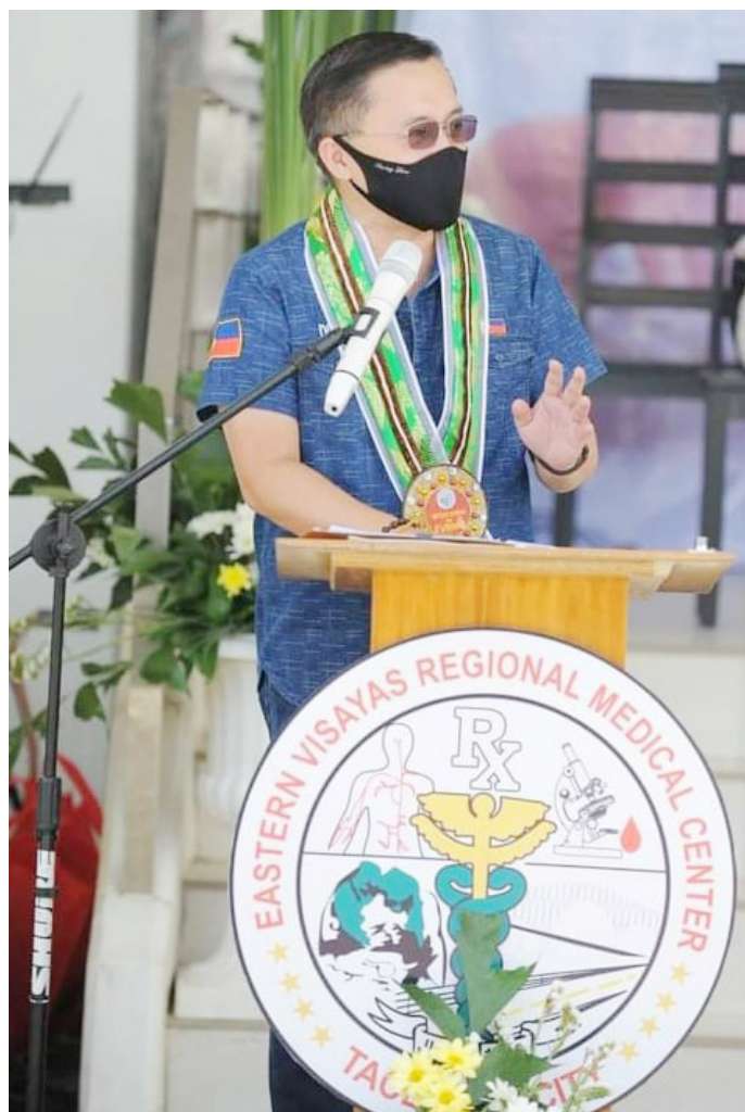
Senator Christopher Lawrence 'Bong' Go promised to allocate P10 million for the maintenance of the Malasakit Center at the Eastern Visayas Regional Medical Center during his visit on Thursday (March 18). During his visit, the senator donated facemasks and face shields to personnel and patients of the hospital.

The Malasakit Center in EVRMC started its operations on May 22, 2018 and served as a one-stop shop