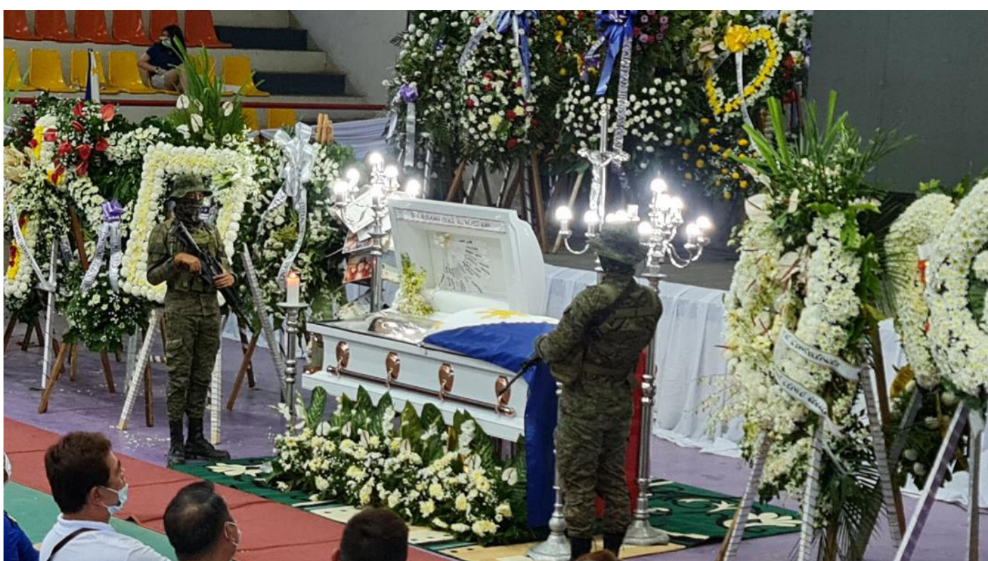
MAYOR RONALD AQUINO. The remains of slain Calbayog City Mayor Ronald Aquino now lie in state at the Calbayog Sports Complex where the Calbayognons can pay their last respects to the 59-year old mayor who died on March 8. The family claims that he was ambushed by the police operatives, who in turn, insisted that what happened was a shootout.