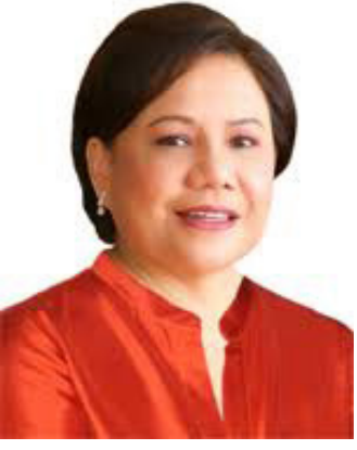
Sen. Cynthia Villar

cacao and its vital contribution in making the Philippines world-renowned and sought-after by chocolate makers from the United States, Japan and Europe.”