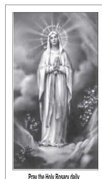
Pray the Holy Rosary daily for world peace and conversion of sinners (The family that prays together stays together)