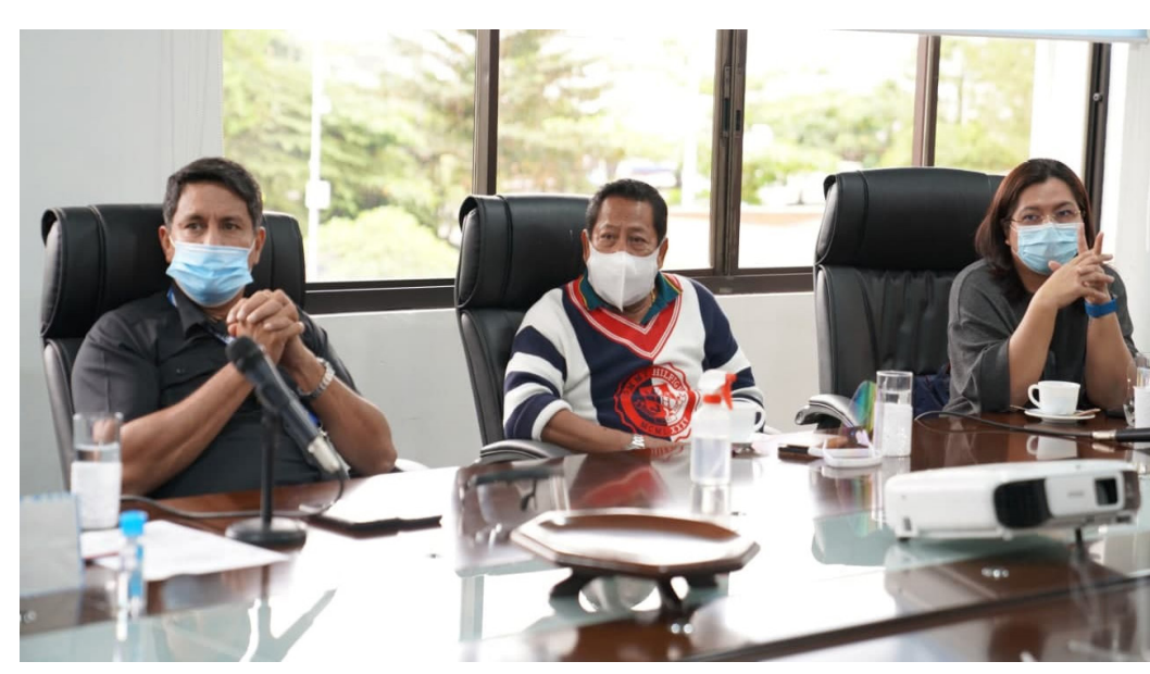
Mayor Richard Gomez conducted a coordination meeting with all mayors in the fourth district of Leyte to further strengthen the border control measures to prevent the spread of African Swine Fever (ASF) in the said areas.