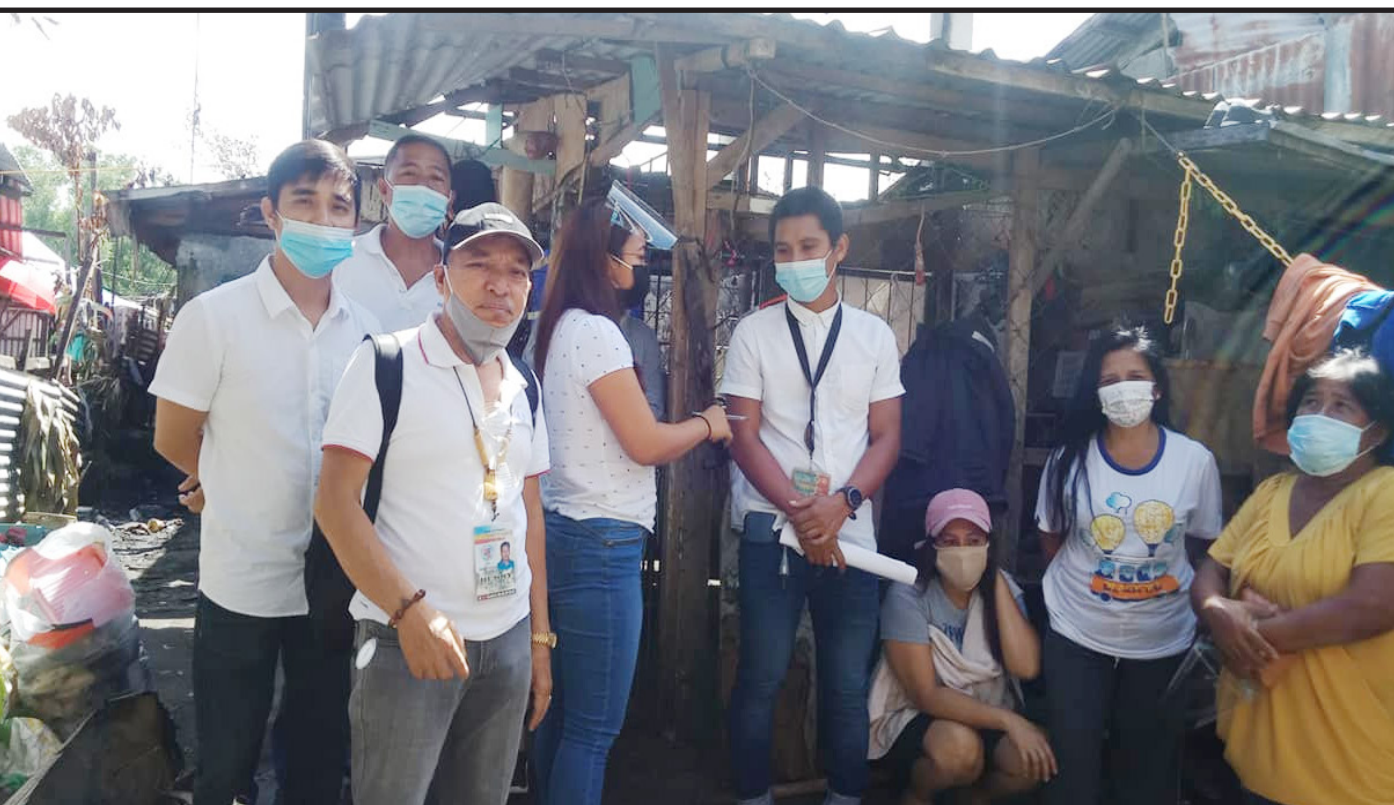
Personnel of the National Housing Authority and the City Housing Development Office of Calbayog city government conducted a validation among fire victims in Barangay Capoocan.

Meantime, the DOH reported of 159 new cases, bringing the region's total cases to 13,969.