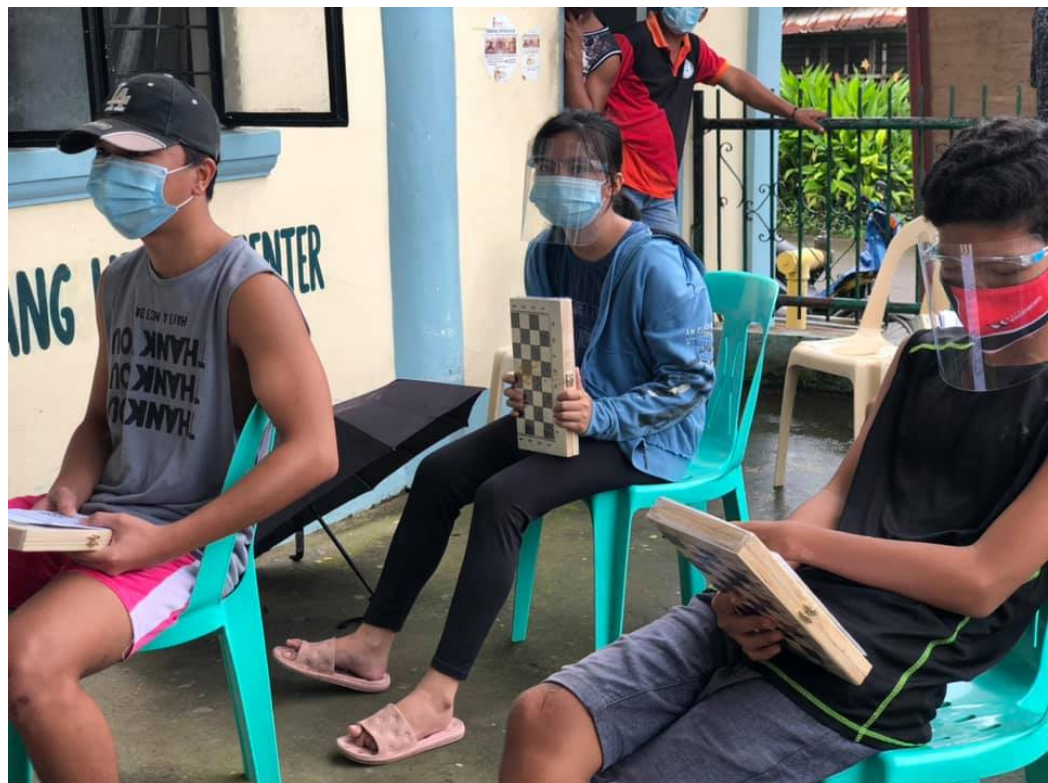
The municipal government of Carigara, Leyte distributed 1,300 chessboards to the youths in the town to keep them away from boredom as the municipality continue to grapple with the coronavirus disease(COVID-19).