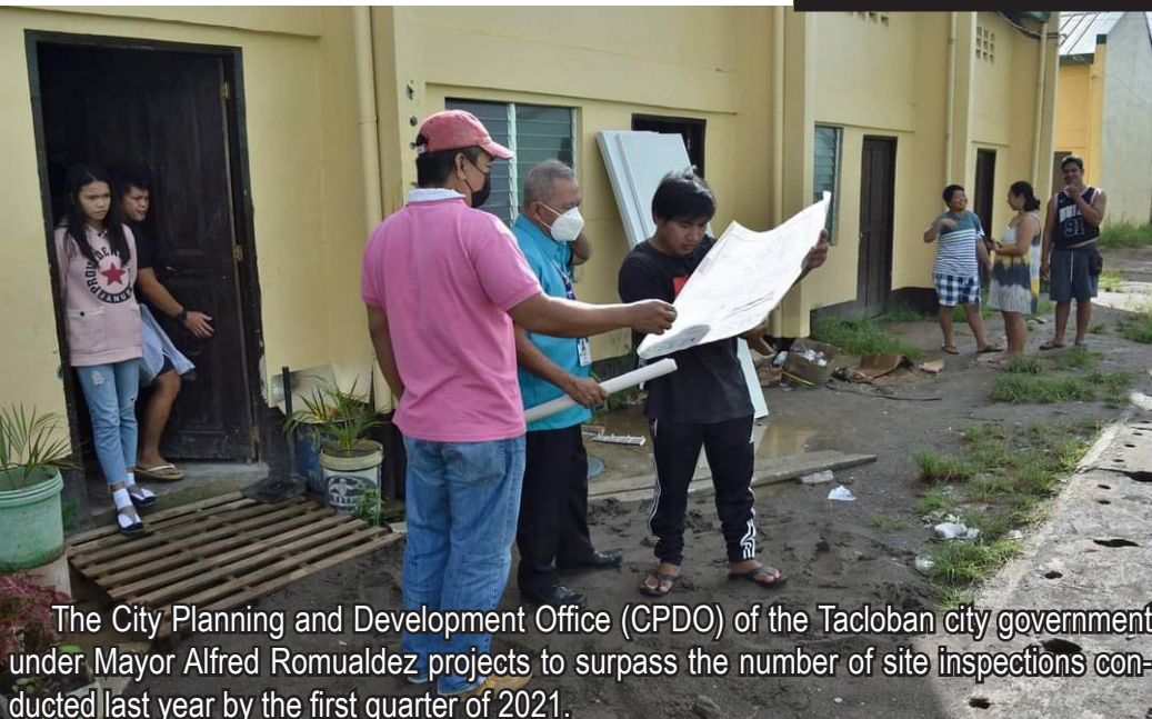
The City Planning and Development Office (CPDO) of the Tacloban city government under Mayor Alfred Romualdez projects to surpass the number of site inspections conducted last year by the first quarter of 2021.