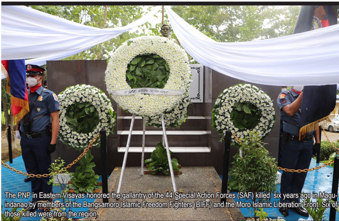
The PNP in Eastern Visayas honored the gallantry of the 44 Special Action Forces (SAF) killed six years ago in Maguindanao by members of the Bangsamoro Islamic Freedom Fighters (BIFF) and the Moro Islamic Liberation Front. Six of those killed were from the region.