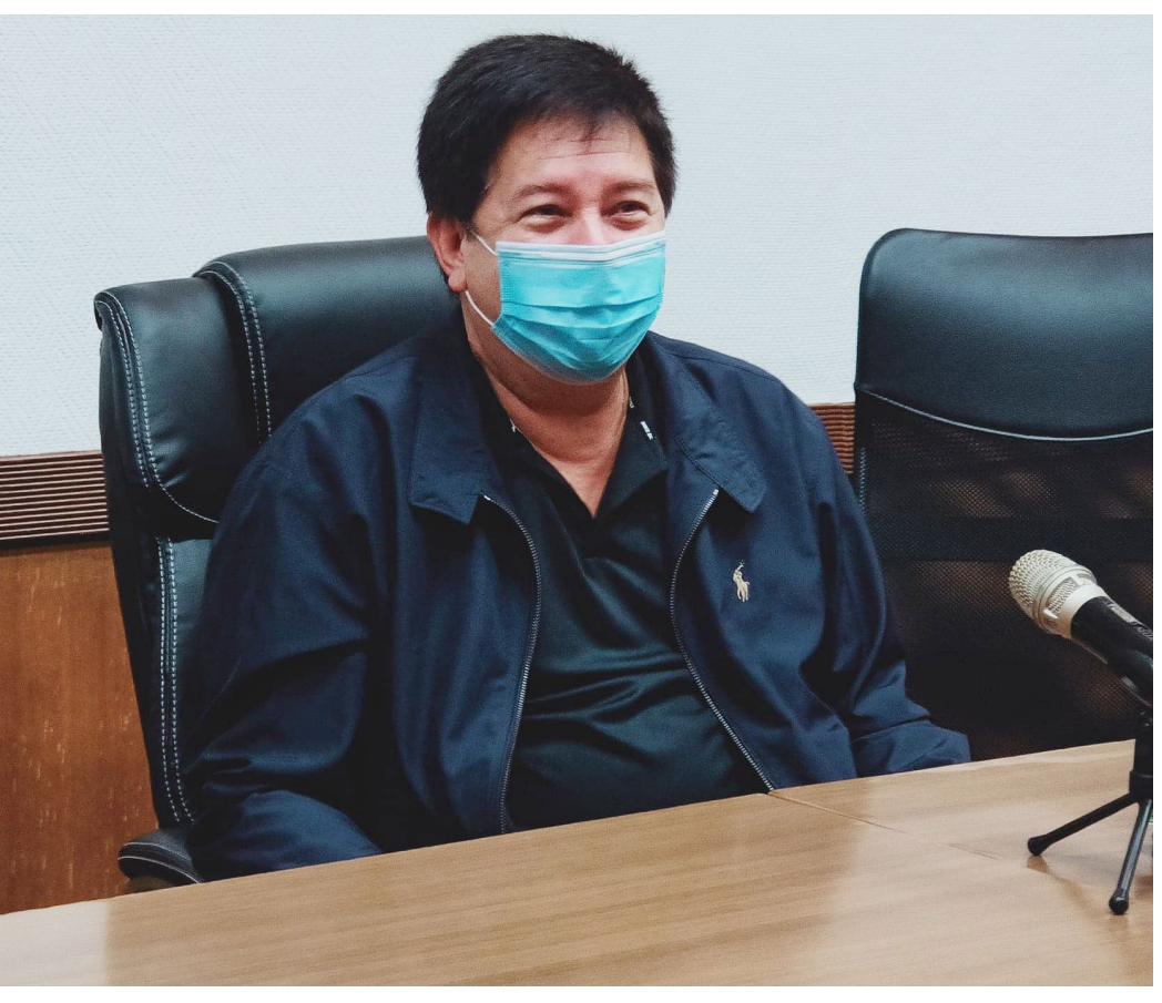
GUINEA PIG. Tacloban City Mayor Alfred Romualdez said that he is willing to be a guinea pig in so far as receiving shots of the anti-COVID vaccines to show the effectiveness of the vaccines. The city mayor has just recovered from the dreaded virus.