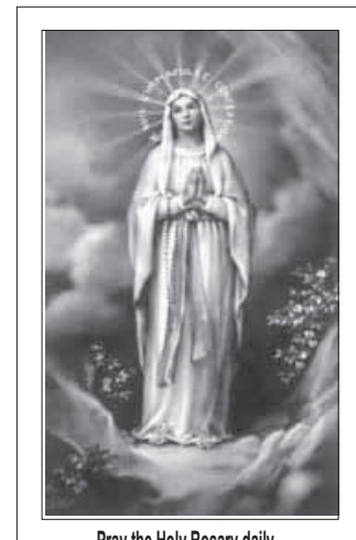
Pray the Holy Rosary daily for world peace and conversion of sinners (The family that prays together stays together)