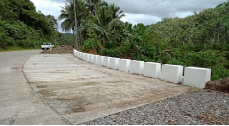
Bgry. Cervantes Slope Protection K0765+460-K0765+480)

CATARMAN, North-ern Samar- As part of the thrust of the Department of Public Works and High-ways (DPWH) to protect lives and properties from natural disasters, the DP-WH-Northern Samar First District Engineering Office(NSFDEO)has recently completed the reha-