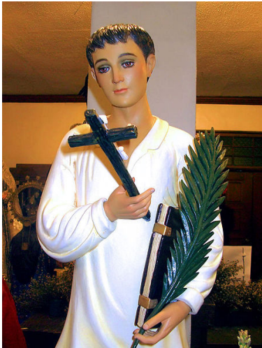
San Pedro Calungsod

Borrinaga dedicated his paper entitled "San Pedro Calungsod: The Bisayan Saint from Leyte" to the Diocese of Maasin, which