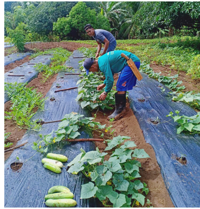
OUTSTANDING YOUTH COUNCIL. The Sangguniang Kabataan of Baybay City was recognized by the US Embassy under its Young Southeast Asian Leaders Initiative due to its various programs particularly its ‘youth in agriculture’ amid the pandemic caused by coronavirus disease.