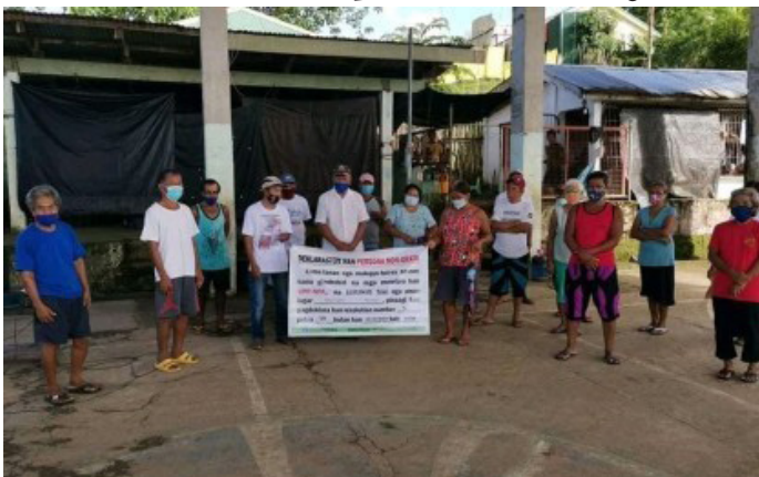
DENOUNCING TERROR. Officials and residents of Logero village in Marabut, Samar during its declaration of the Communist Party of the Philippines (CPP) and its armed wing, New People’s Army (NPA) as persona non-grata on Jan. 5, 2021. The Philippine Army on Saturday (Jan. 9, 2021) said the people condemned the rebel group’s treacherous attacks and other human rights violations, including the ambush-slay of a cop on Dec 10, 2020.

According to a police report, the victims on board a patrol car were heading back to the police station after a court appearance in nearby Basey