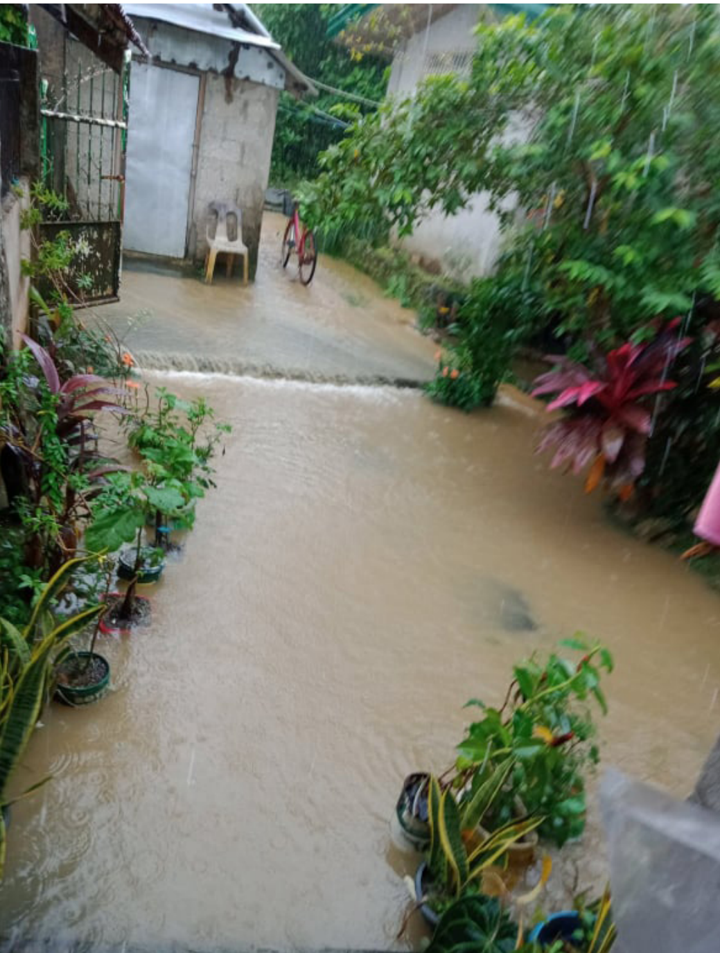
FLOOD. The town of Lavezares was among the areas in Northern Samar that experienced flooding due to the continuous rains experienced by the region over the weekend. Photo shows several houses in Brgy. Libertad in the said town were hit by up to knee-deep rain water.