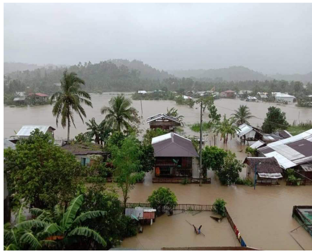
FLOODING. The nonstop rain spawned by the tail frontal system resulted to flooding which submerged several houses in different parts of the region. Photo shows houses in Dolores town, Eastern Samar affected by the rise of rain water.

A rock fall was reported in Barangay Binaloan, Taft town, Eastern Samar dumping four cubic meters of rock, the Department of Public Works and High-