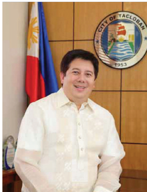
Mayor Alfred Romualdez

TACLOBAN CITY -Mayor Alfred Romualdez of this city clarified that they have not yet allocated for any procurement of anti-COVID vaccines.