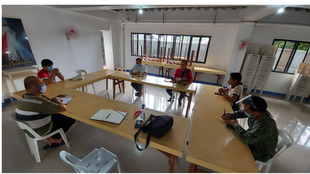
The Inter-Agency Task Force in Calbayog City during their recent ad hoc meeting agreed to allow home and hotel quarantine as the city continue to grapple its increasing COVID-19 cases.

TACLOBAN CITY-The city government of Calbayog has issued an executive order for a new coronavirus disease (COVID-19) quarantine protocols which allows home quarantine for returning residents coming from low risks areas in the region. The executive Order 38, signed by Mayor Ronaldo Aquino, also covers returning Overseas Filipino Workers. The city, as of Tuesday (Dec.1), has 676 COVID-19 cases with 69 of them have recovered. Deaths due to COVID-19 complications now reached to seven.