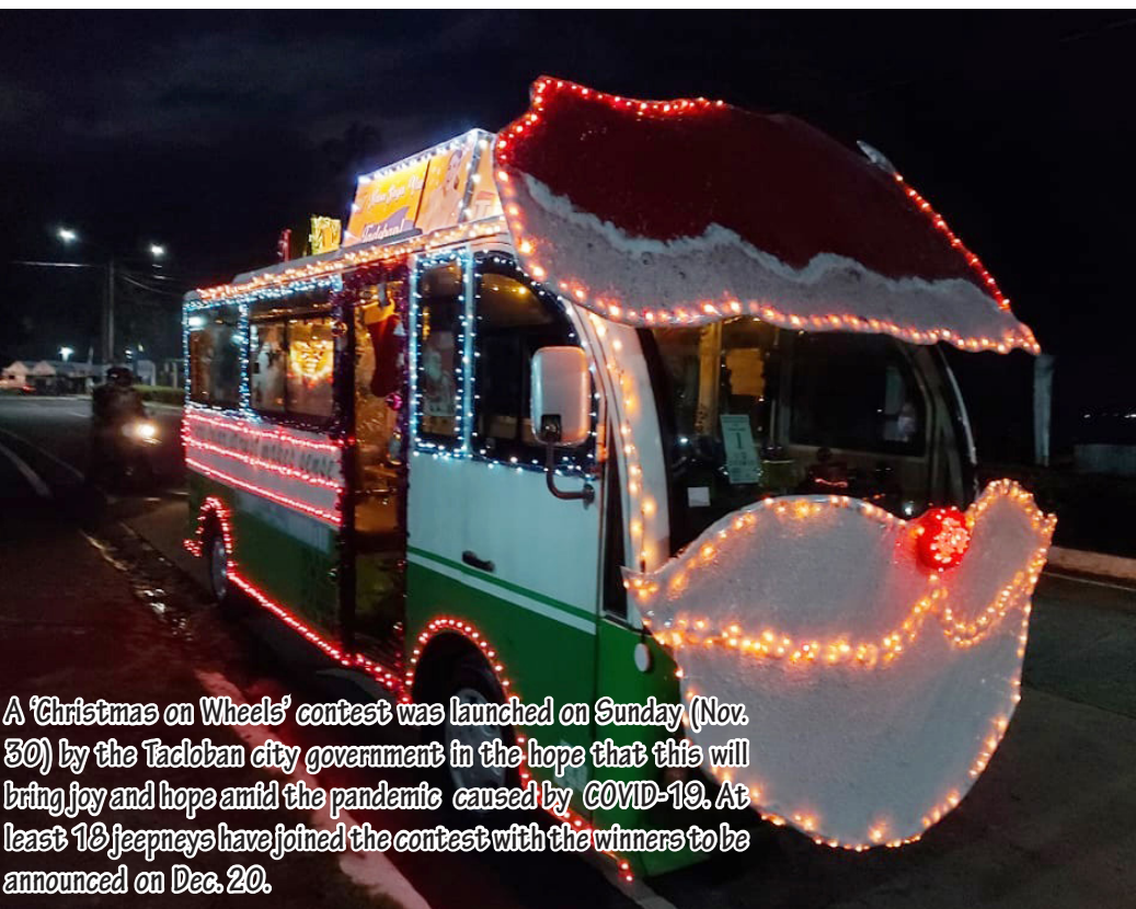
A 'Christmas on Wheels' contest was launched on Sunday (Nov. 30) by the Tacloban city government in the hope that this will bring joy and hope amid the pandemic caused by COVID-19. At least 10 jeepneys have joined the contest with the winners to be announced on Dec. 20.

TACLOBAN CITY- This city glimmers with Christmas spirit during the launching of the Christmas on Wheels Competition 2020 in partnership with TNT / PLDT/Smart Telecommunications, Inc.