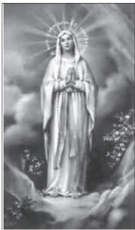
Pray the Holy Rosary daily for world peace and conversion of sinners (The family that prays together stays together)

To be sure, there are many other ways we can avail of to make sure that we avoid falling into self-indulgence!