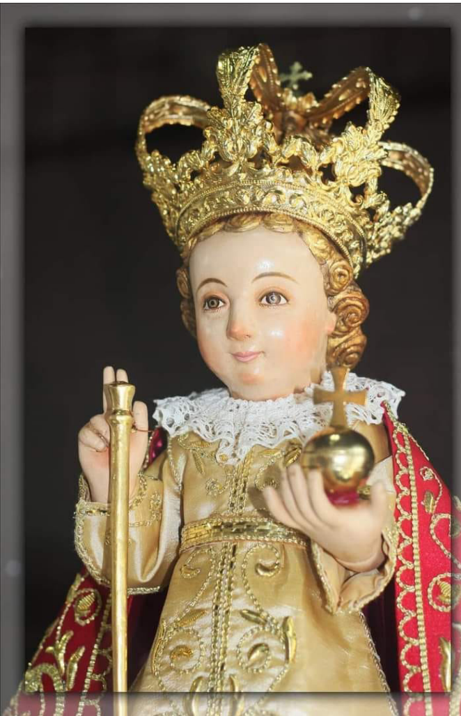
WELCOME HOME. Lost for 32 years, the image of the Santo Niño de Malitbog finally returns home to Malitbog Church where He was enshrined since 1857 on Nov. 28.