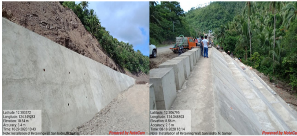
Retaining wall (K0687+850-K0687+957) Slope Protection (K0687+850-K0687+600)