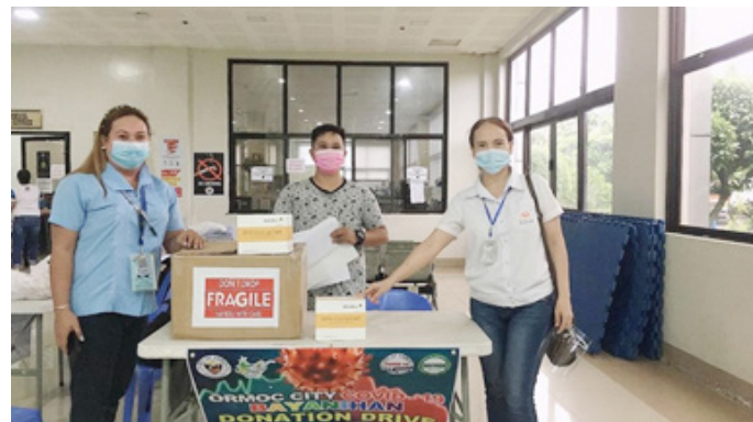
EDC turnover 500 pcs. RAT kits donation to the city government of Ormoc.

cessory equipment worth P25 million to enable the City and adjacent towns to have its own COVID-19 testing facility that will