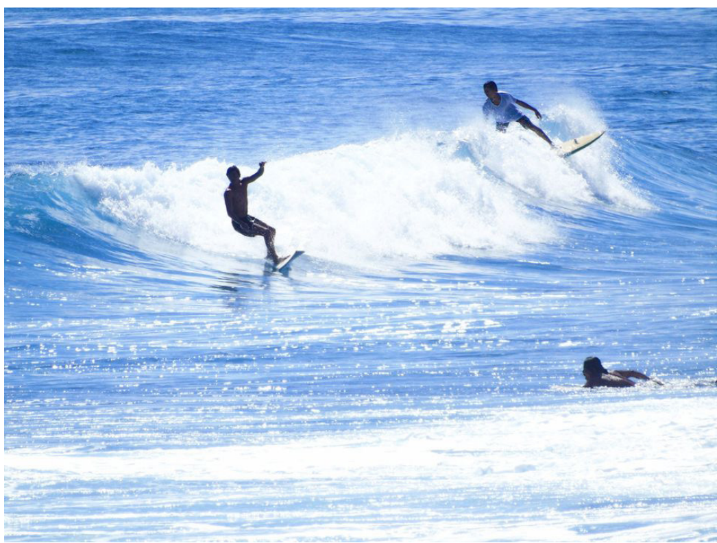
A two-day surfing competition was held in Guiuan town, Eastern Samar with the organizers of the event that ended last Oct.9 saying they had the permission from the Provincial Inter-Agency Task Force. Sports competition, especially involving close physical contacts, are not allowed during this time of pandemic.