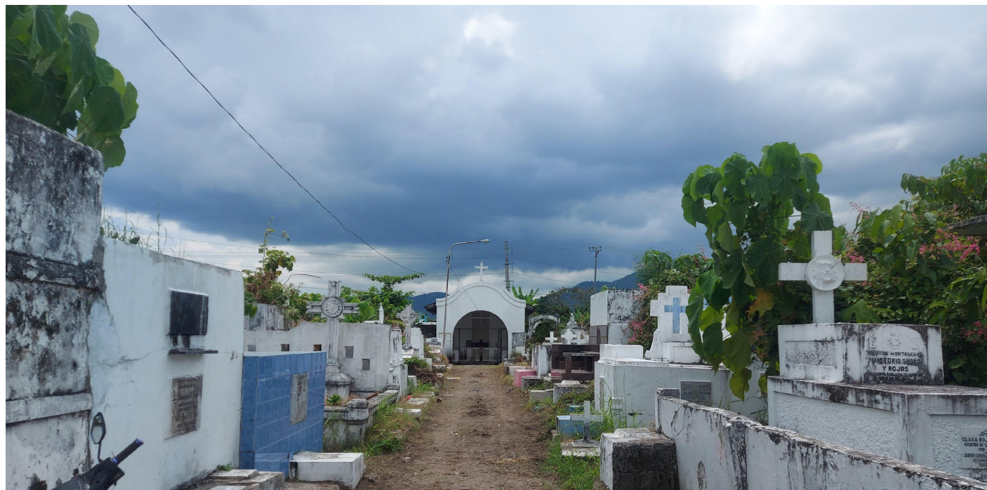
Local government units in Eastern Visayas will be closing their respective cemeteries during All Saints and All Souls Days as another measure to prevent spread of the coronavirus disease. Photo shows the Tacloban Catholic public cemetery which will be closed starting on October 29 until November 4. (story on page 3).