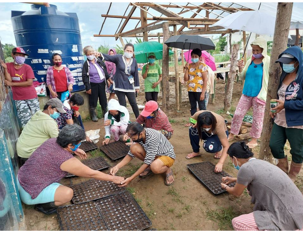
Women at the resettlement site located at the Kawayan Ville are assured of their food needs as they join a farming workshop initiated by the Department of Agrarian Reform (DAR).