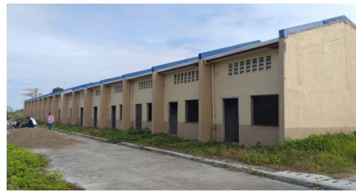
EMPTY HOUSES. Some of the completed but still unoccupied houses in Tanauan, Leyte for victims of Super Typhoon Yolanda. The Regional Development Council (RDC) in Eastern Visayas urged the National Housing Authority (NHA) to come up with uniformed guidelines in the selection of beneficiaries of post-Yolanda housing projects.

The unfair selection of recipients, absence of elec-