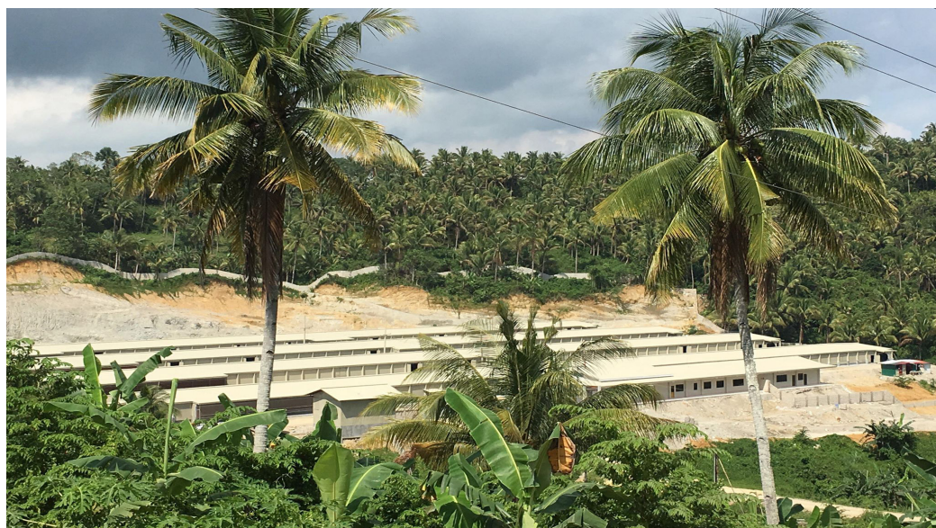
The operation of a dressing plant located in Albuera, Leyte, reportedly owned by Palompon Vice Mayor Ramon Oñate, is being questioned due to alleged violations on environmental protection.

leged violations of Oñate on Section 27 and 28 of the Republic Act 9275 (Clean Water Act 2004) for exceedance of the Department of Environment