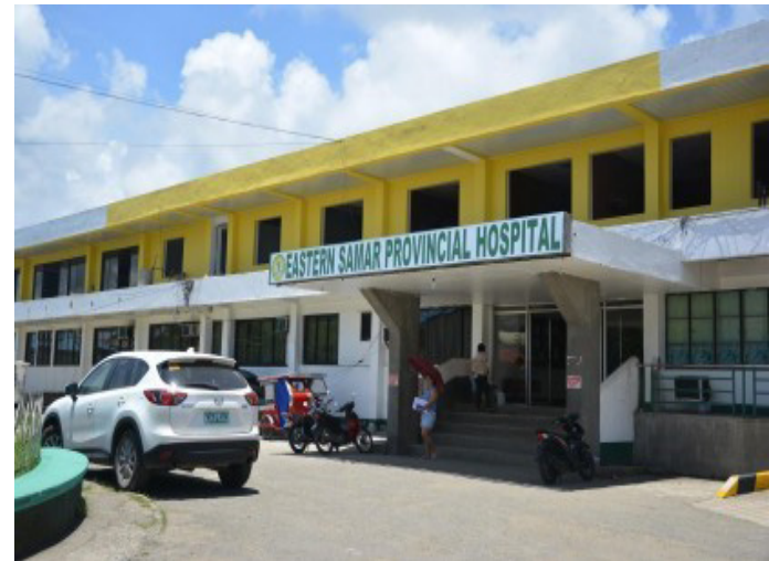
DIALYSIS CENTER. The Eastern Samar Provincial Hospital in Borongan City. The government hospital on Wednesday (Sept. 30, 2020) said it will open the first dialysis center in the province this year that would provide free services for indigent patients.

The ESPH disclosed that some 156 dialysis patients in the province travel for hours two to three times per week to undergo treatment in Ta-