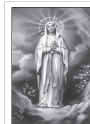
Pray the Holy Rosary daily for world peace and conversion of sinners (The family that prays together stays together)