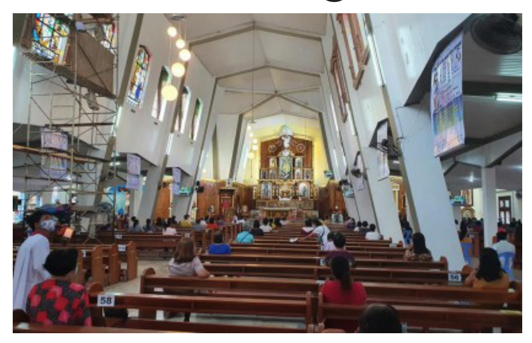
DISTANCING. Attendees of a novena mass at the Our Lady of Holy Rosary Cathedral in Naval town, Biliran observe physical distancing. The local government on Friday (Sept. 25) said new travel restrictions to avoid mass gatherings will be imposed from Oct. 1 to 3, as the town celebrates its town fiesta.

"Visitors are not allowed especially in households with senior citizens, minors, pregnant, and other vulnerable individ-