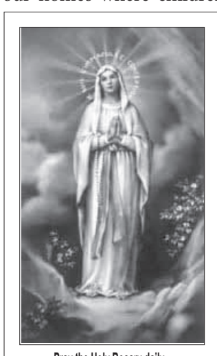
Pray the Holy Rosary daily for world peace and conversion of sinners (The family that prays together stays together)

required. Why, it is something that we cannot afford to lose if we are to survive and make it in this life. Either we have it, or we per-