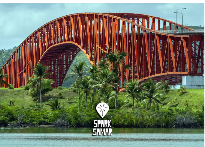
After six months of work stoppage, the San Juanico Lighting Project has resumed last month. The stoppage was due to quarantine restrictions. The P80 million worth project is expected to be finished within before the end of the year.

plete the project by the end of this year and looking at the possibility of having a test run this October," Tiopes said.