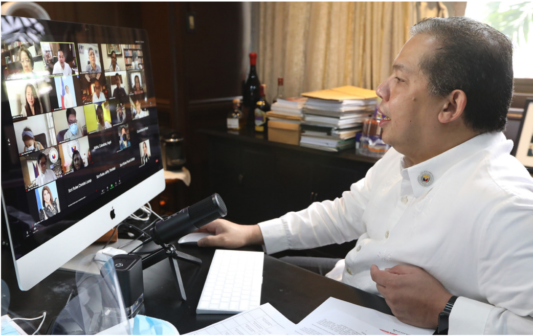
House Majority Leader and Committee on Rules Chairman Rep. Martin Romualdez presides the Committee on Rules meeting on virtual discussing vital measures and weekly agenda for the plenary session of the House of Representatives.

Lifestyles... ...from Page 4 assets and net worth they possess. Some even employ lawyers to help them file their SALNs by using approaches and technicalities so taxes will not be paid fully. Government financial expert should find ways how to really determine assets and networth a taxpayer possesses to beef up much-needed government resources.