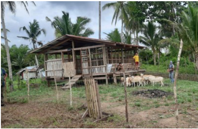
SHEEP FARMING. The newly-established sheep multiplier farm in San Miguel, Leyte. The Department of Agriculture (DA) on Wednesday (Sept. 23, 2020) said it provided the farm's initial stocks of 15 sheep heads consisting of 12 Katahdin ewes and three white dorper rams.