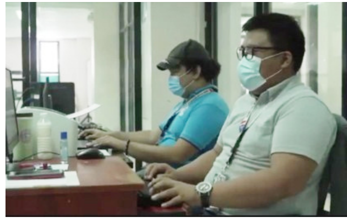
ONLINE APPLICATION. Photo shows some personnel of the Management Information System office of Tacloban City managing the digital issuance of health certificates. The city government on Thursday (Sept. 24, 2020) said they will start accepting online applications for the health certificate this week.

She added the health certificate is free and will be used while the public