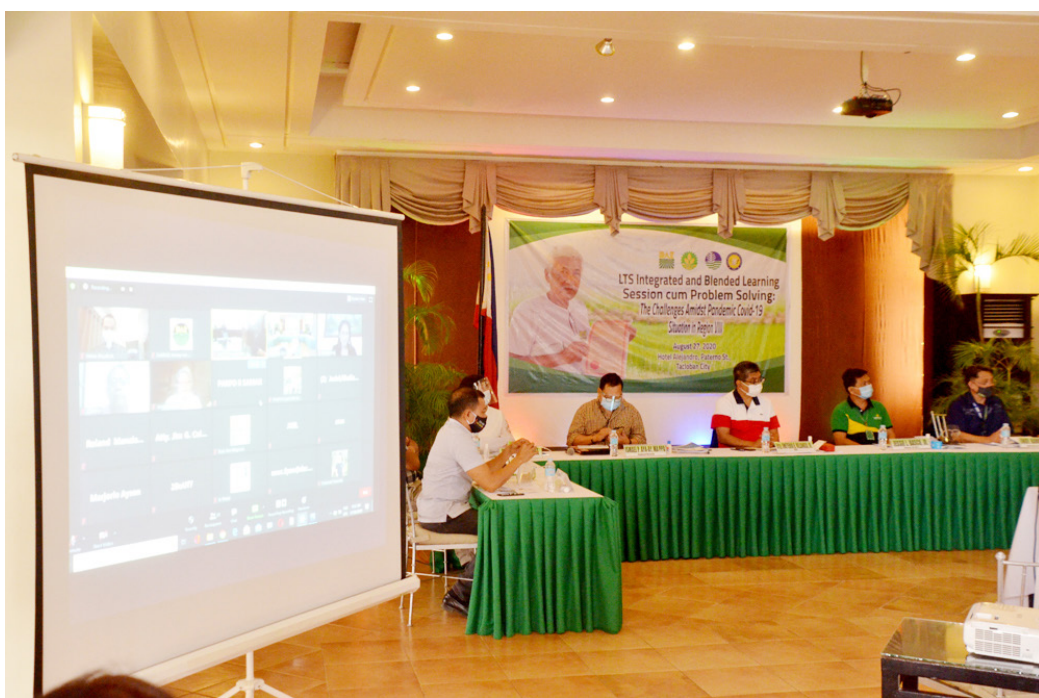
The Department of Agrarian Reform (DAR) Eastern Visayas now also adopts virtual problem solving session under the new normal.