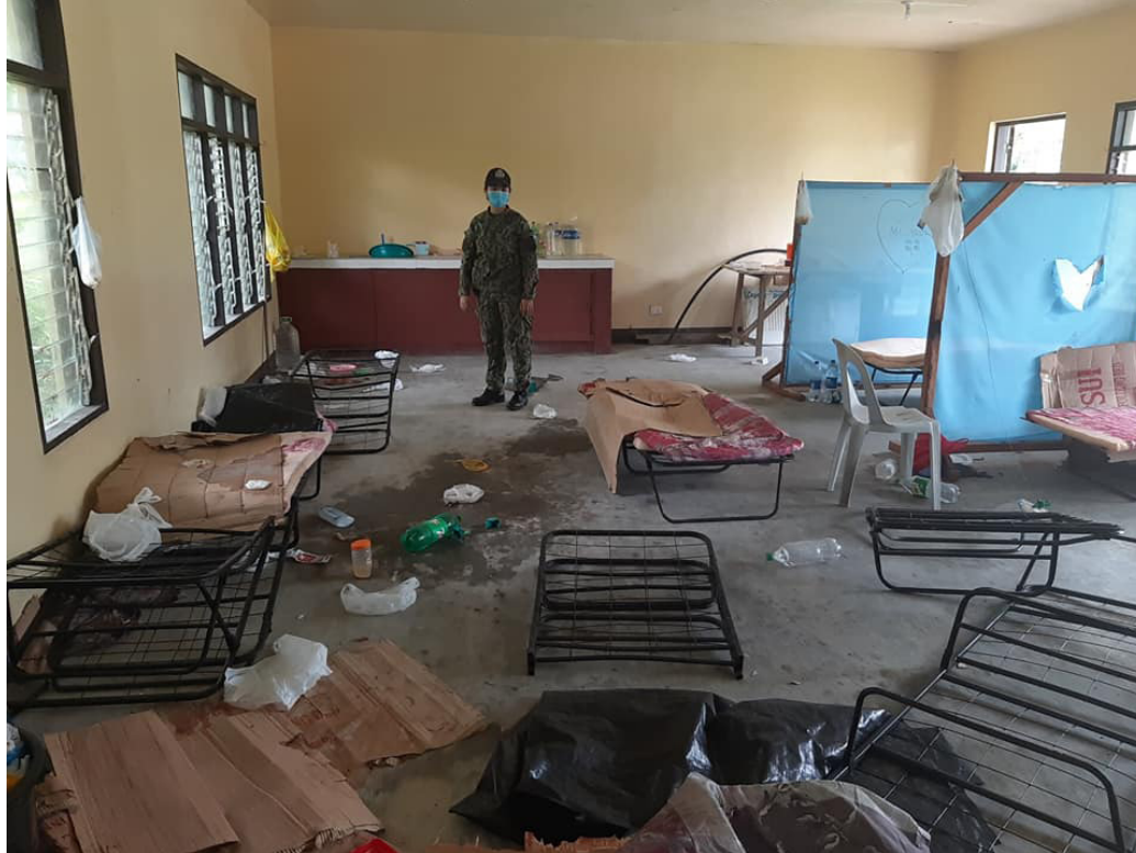
The municipal government of Calbiga in Samar is mulling of filing a complaint against an individual confirmed to have COVID-19 after he reportedly caused damages at the isolation facility.