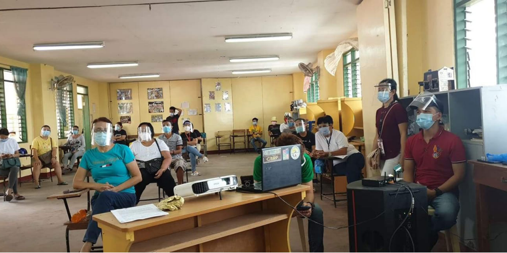
Sen.Christopher “Bong” Go extended P5,000 cash assistance to individuals from Catbalogan City who were infected of the coronavirus disease (COVID-19). (RENE CASTINO)

TACLOBAN CITY – More than 500 confirmed coronavirus disease (COVID-19) patients from Catbalogan City are to receive financial assistance from Senator Christopher Lawrence “Bong” Go. This was revealed by Mayor Dexter Uy who said that the distribution of the P5,000 cash assistance started last September 23. “The P5, 000 cash assistance is unexpected because the assistance that we are asking from the President through Sen. Bong Go are facilities and also food packs in case the number of confirmed cases increases because we are also providing food assistance to them,” Uy said. The city mayor said that it was her elder sister, Councilor Stephany Uy-Tan, who contacted the office of Sen. Go who sought for assistance on the city government’s response on COVID-19. “We did not expect it. They asked for the list of people who turned positive with COVID-19 and they provided fund for each worth P5,000,” he added. Both the city mayor and his elder sister have survived the COVID-19 scare. As of September 24, Catbalogan has a total of packs to COVID-19 patients, Mayor Uy added. Meantime, the city mayor disclosed that they have received assistance worth P26 million for the construction of a 64-bed capacity isolation facility. The additional isolation facility is important as preparation for the possible surge of COVID-19 in the city.