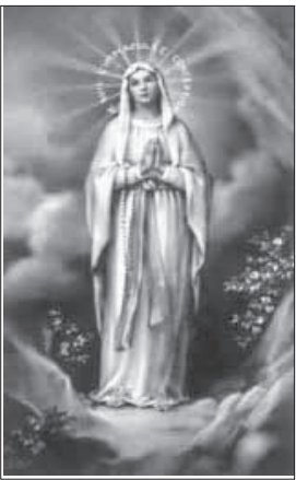
Pray the Holy Rosary daily for world peace and conversion of sinners (The family that prays together stays together)

We ask this through our Lord Jesus Christ, your Son, who lives and reigns with you and the Holy Spirit, one God, forever and ever, Amen. (Courtesy of Daughters of St. Paul)