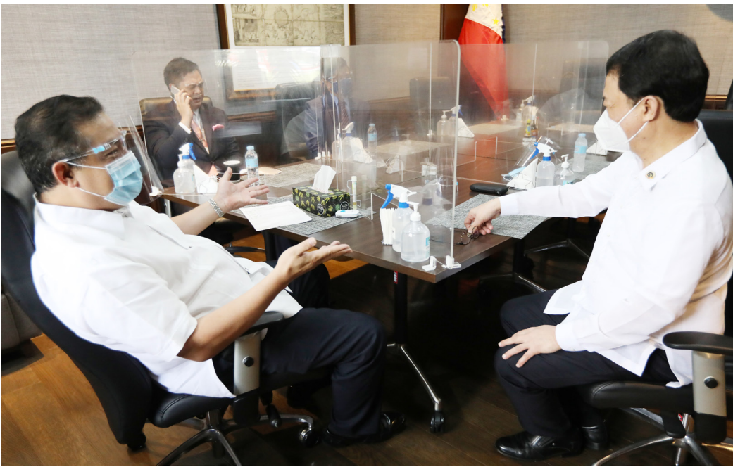
House Majority Leader and Leyte Rep Martin Romualdez (left) talks with Department of Justice Secretary Menardo Guevarra (right) during a short meeting at the House of Representatives after the Budget Briefing of the 2021 Budget of the Department of Justice, with them is Secretary Martin Andanar (2nd left) of the Presidential Communications Operations Office.