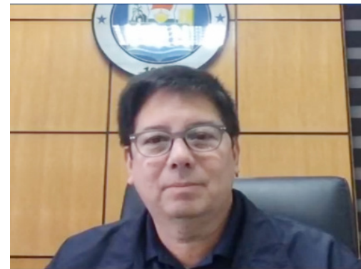
MAYOR ALFRED ROMUALDEZ

help address the coronavirus (COVID-19) crisis. Romualdez made the suggestion during a virtual Networking Briefing program of Presidential