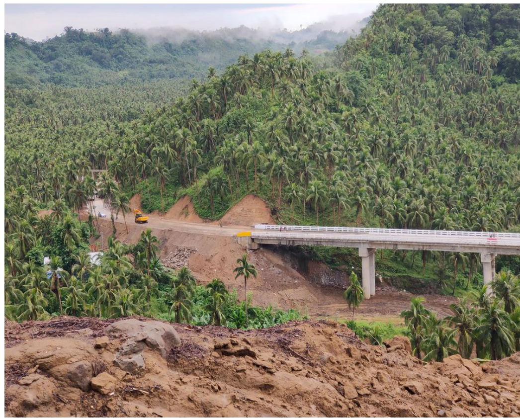
Despite of the threat of COVID-19, road construction funded by Pamana will continue. This was assured by its regional area manager, Emilda Bonifacio.

guinao town in Samar province as an example which was only accessible by a five-hour boat ride from Gandara town but could now be reached by less than an hour after their agency funded a road project there.