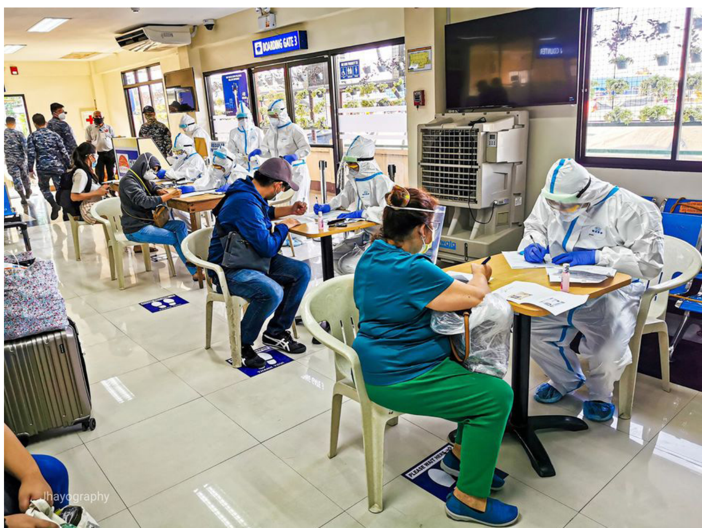
The appeal of the region's officials for a month-long ban on the return of the locally stranded individuals amid spike of COVID-19 in Eastern Visayas will be tackled by the National Inter-Agency Task Force. Photo shows LSIs from Ormoc City as they filled up forms as part of the process on returning residents.