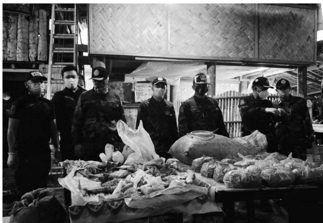
Police authorities in Northern Samar recovered components in making of improvised explosives in San Antonio,Northern Samar worth P3.5 million.The materials are being used in making dynamites used for illegal fishing by some locals in the area,says the authorities.