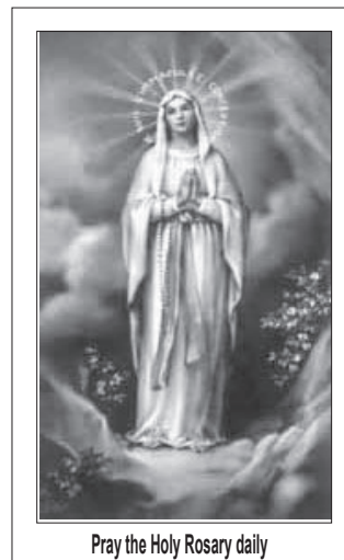
for world peace and conversion of sinners (The family that prays together stays together)

We start complaining when we do not get what is due us. The tendency of workers to seek for just wages according to standards set by law must be respected. It is their right to demand for what is due them according what is prescribed by law. In many instances, workers are forced to complain over unjust wages that fall short of the minimum. These workers do not care too much on getting what is just compensation for their labor, all they need is the fulfillment of the pay due them. The predicament is often caused by employers who deprive their workers of just wages as mandated by law. While they demand honest work beyond regular