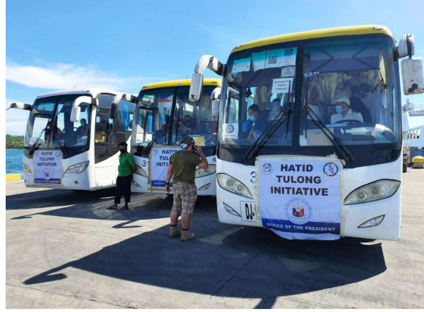
Locally stranded individuals(LSIs) or returning residents can still return to Eastern Visayas contrary to earlier report, clarifies the regional head of the COVID-19 Task Force. The return of the LSIs was cited as among the region for the surge of COVID-19 cases of the region.

As Limasawa now affirmed as the site of the First Easter Mass