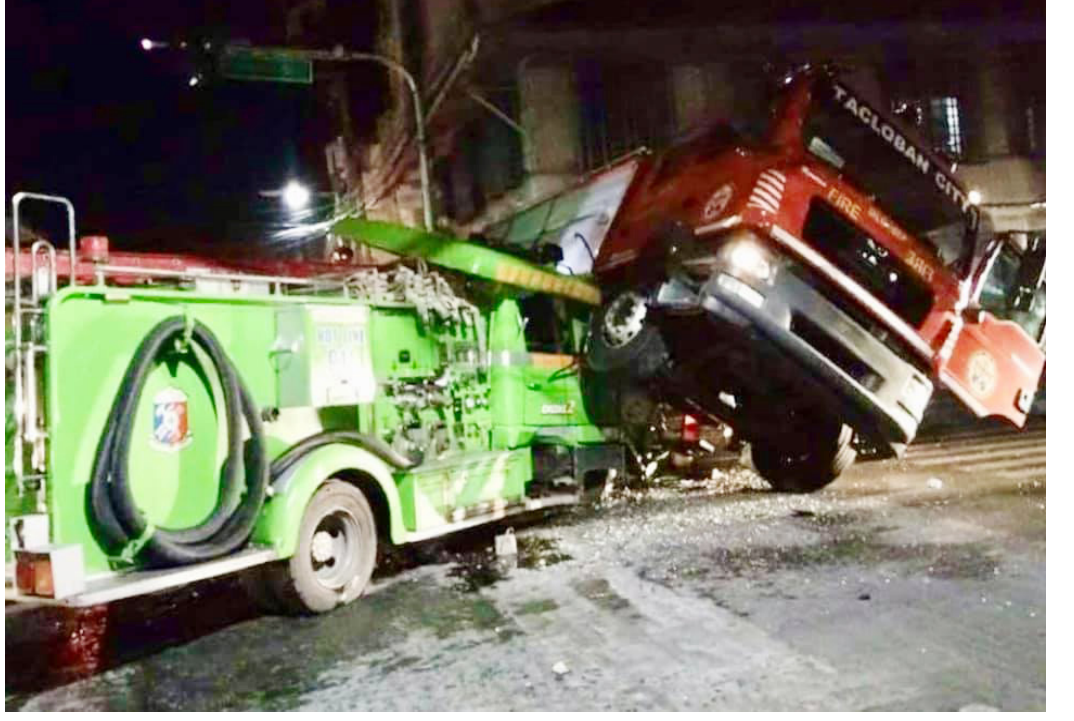
Responding to a fire call has resulted to a freak accident between two fire trucks that collided along Paterno and Imelda Streets, Tacloban City on Sunday(Sept.6) night. The drivers of the two firetrucks and one passenger were hurt during the accident.

Based on the report, the two firetrucks were heading towards Barangay 62, Sagkahan District, this city, to respond to a fire call when they bumped in an intersection along Pa-