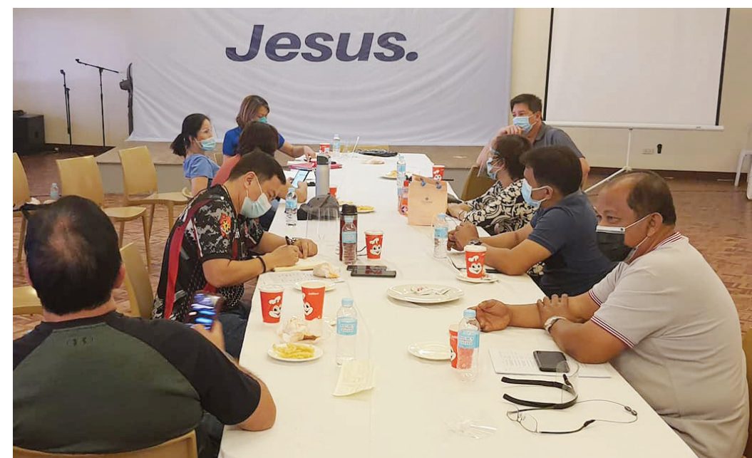
Mayor Alfred Romualdez called for a meeting on September 5, 2020 at the Patio Victoria to discuss on the increasing number of COVID-19 cases in the city and how this can at least be reduced. He also wanted to how are where these cases originated and which barangays to ensure a better contact tracing. (TACLOBAN CITY INFORMATION OFFICE)