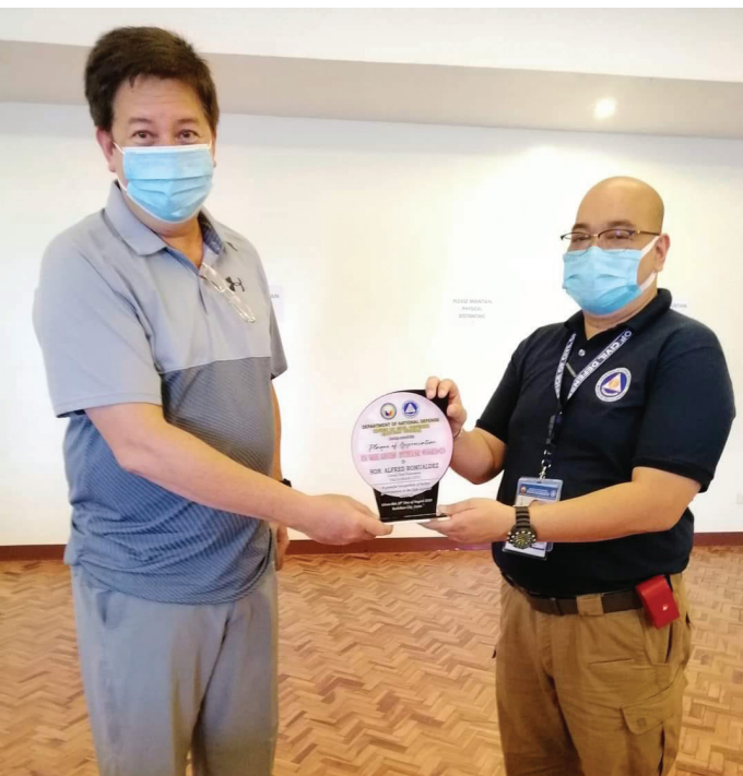
RECOGNITION. Tacloban City Mayor Alfred Romualdez(left) receives a recognition from the Office of Civil Defense (OCD) for his efforts in combatting against coronavirus disease (COVID-19). Photo shows the city mayor receiving the plaque of appreciation from OCD Regional Director Lord Byron Torrecarion during a simple rites held at Patio Victoria on September 2.