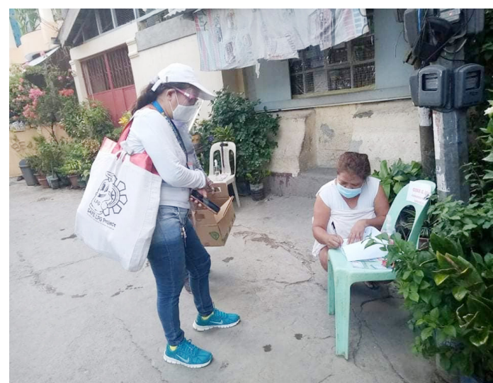
Families in Catbalogan City are to receive P1,000 as cash assistance from the city government to help them somehow during this time of pandemic caused by COVID-19.

But with the rising of COVID-19 cases in Catbalogan, Mayor Uy placed