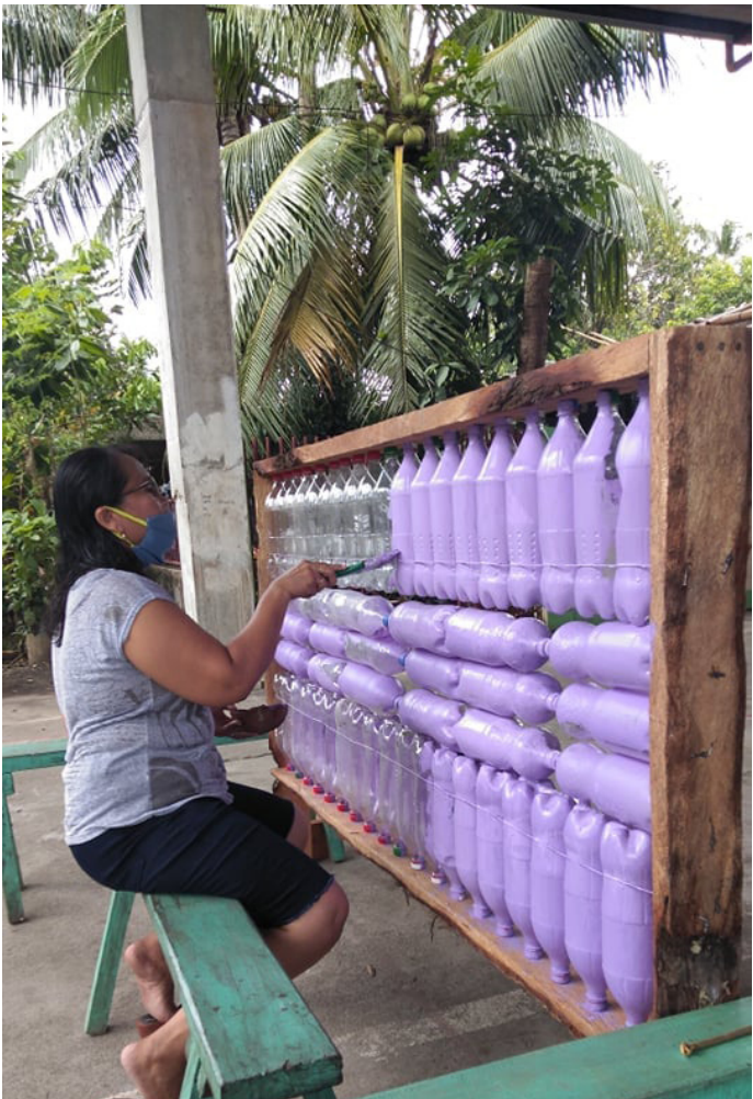
A quarantine facility in Saint Bernard is being constructed using recycled materials. The Southern Leyte town has currently six COVID-19 patients. (Photo Courtesy)