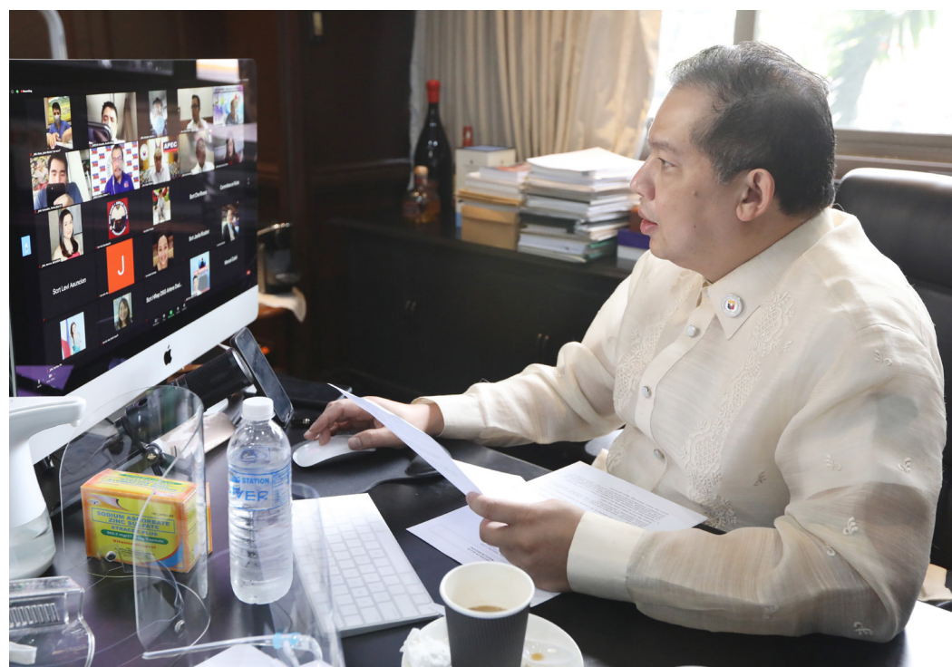
House Majority Leader and Committee on Rules Chairman Rep. Martin Romualdez presides over the weekly meeting with members of the Committee on Rules in virtual via Zoom discussing priority measures including General Appropriation Bill or the proposed 2021 National Budget.

over 56 air-conditioned rooms from converted shipping containers and fabricated materials as temporary mobile facilities for medical frontliners in EVRMC and the Schistosomiasis Hospital in Palo, Leyte. In a joint effort initiated by the OCD and the Romualdezes, at least 160 medical frontliners of EVRMC also enjoyed three months of free accommodation at the Leyte Park Hotel & Resort and Madison Park Hotel in Tacloban City. (PR)