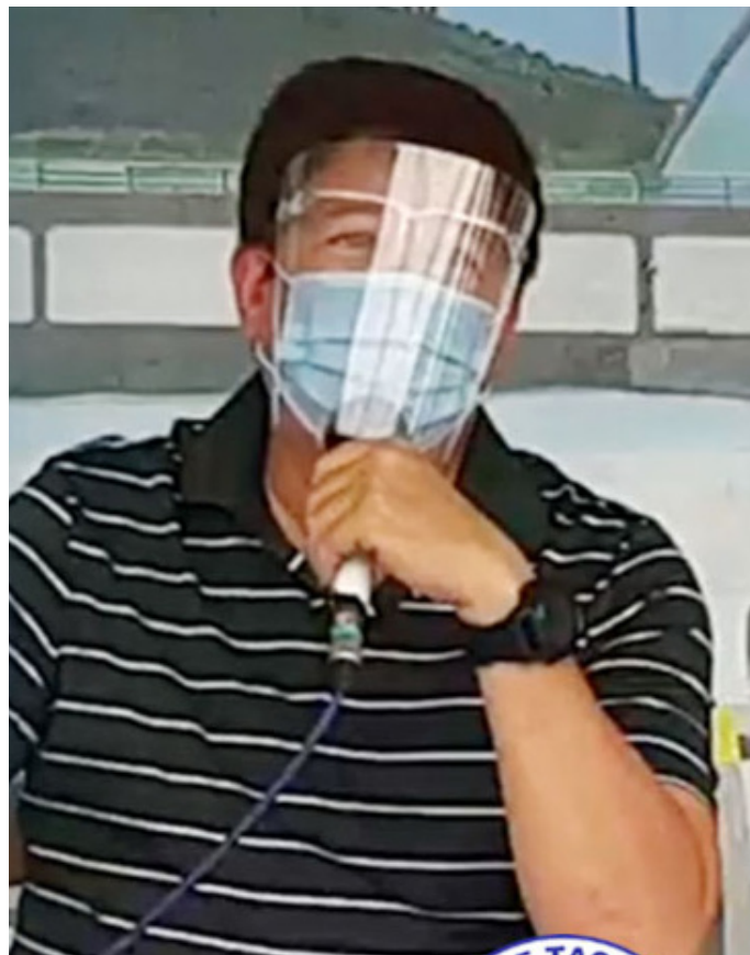
MAYOR ALFRED S. ROMUALDEZ