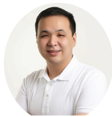
Gov Michael Reynolds Tan

TACLOBAN CITY-The 100-bed COVID-19 isolation facility in the Samar Provincial Hospital is now ready to be used. This was disclosed by Samar Governor Michael Reynolds Tan who said that the construction of the facility is a big boost to the provincial government's effort in containing coronavirus disease (COVID-19). "With our improving testing capacity, we are also increasing our bed capacity for isolation" the governor said. The 100-bed isolation and quarantine facility equipped with air conditioning units with toilet and shower rooms for patients is now ready for operations.