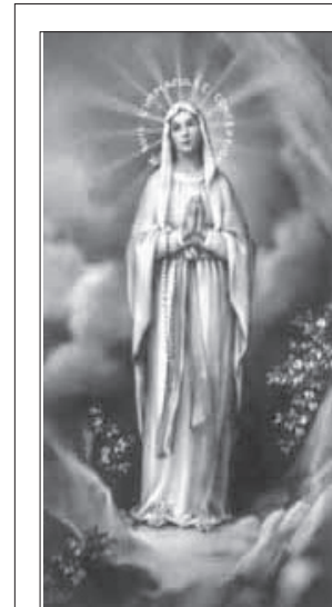
Pray the Holy Rosary daily for world peace and conversion of sinners (The family that prays together stays together)

The consequences of the quarantines where people were locked in homes and communities reached se-