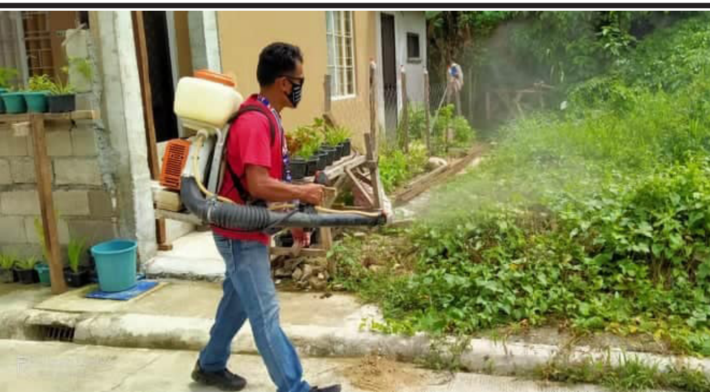
DENGUE FEVER CAMPAIGN. While the campaign to stop further the spread of the coronavirus disease 2019(COVID-19) remains, the City Health Office of Tacloban city government continue its efforts against dengue fever by conducting fogging operations to eliminate breeding places of mosquitoes that causes dengue fever. Tacloban City has more than 270 cases with one death as of last month.