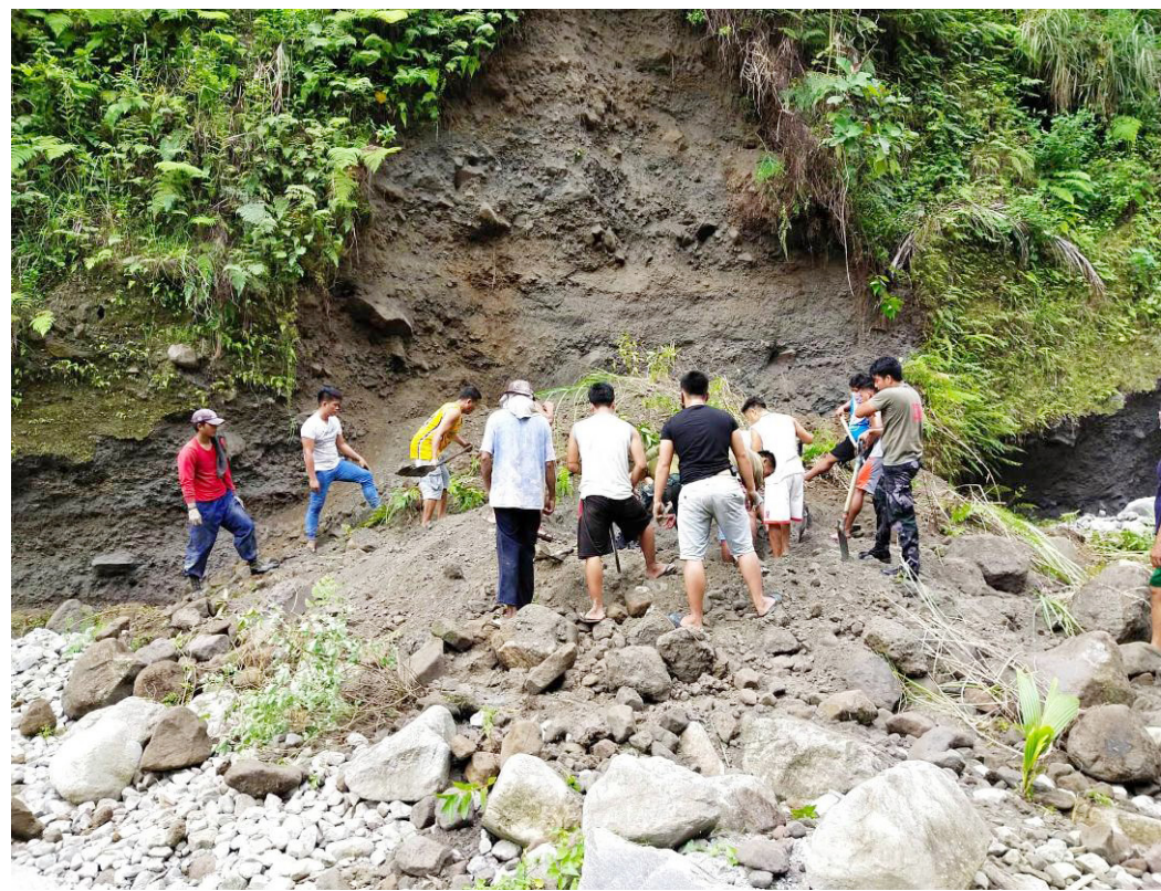
A landslide incident in Barangay Canlawis, Pintuyan, Southern Leyte resulted to the death of three men last July 31.

When police arrived at the scene, some people from the community, roughly half a kilometer distance, were already digging with the use of shovel