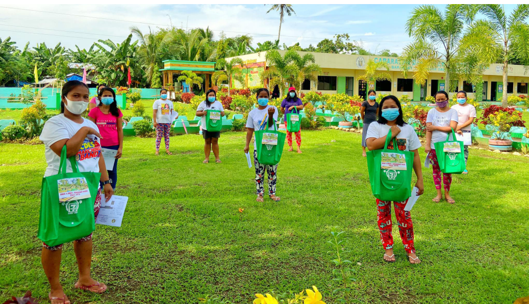
Parents receive free school supplies for their pupils at the Cabarasan Daku Elementary School in Palo, Leyte. Under the distance learning modality, teachers will distribute self-learning materials to the students at home amid the pandemic.

PALO, Leyte- A public elementary school in this town has launched "IsCOOL4ALL" project to make education accessible to their 220 enrolled pupils amid the coronavirus disease (COVID-19) pandemic.