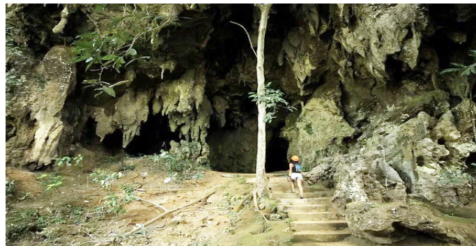
The town of Basey, Samar has cancelled the reopening of its tourist attractions like the Sohoton Cave Natural Bridge Park due to the increasing number of COVID-19.

planning to open their tourist destinations which includes the Sohoton Cave Natural Bridge Park that now features a lighting inside the cave that will allow tourists to fully appreciate the beauty of natural attraction inside it.