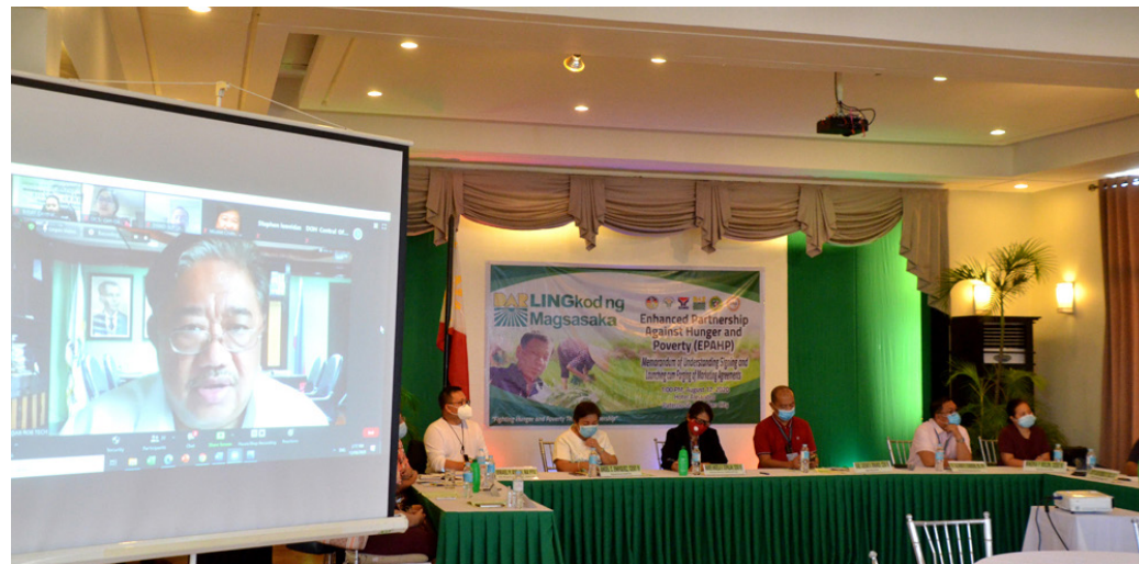
Fourteen agrarian reform beneficiaries organizations (ARBOs) from different parts of Eastern Visayas sealed marketing contracts simultaneously with 16 institutional buyers thru a virtual ceremony on Wednesday.

Meanwhile, Agrarian Secretary John Castricones