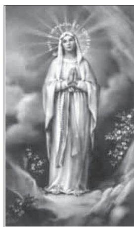
Pray the Holy Rosary daily for world peace and conversion of sinners (The family that prays together stays together)

Commentaries from readers whose identities they prefer to remain anonymous can be accommodated as "blind items". It will be our editorial prerogative, however, to verify the veracity of such commentaries before publication.