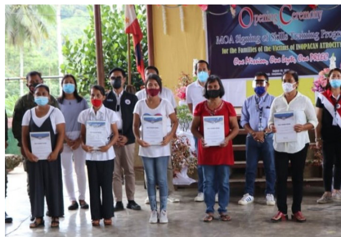
Victims of massacre carried out by the New People's Army in 1980s under its infamous purging activity received assistance from TESDA.