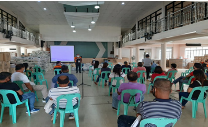
District Head presents the schools "Learning Continuity Plan to the 29 Punong Barangays of Pastrana and to Local Chief Executive.

As part of navigating the new normal, Pastrana District presented the emergency roadmap to the local government unit with the presence of the barangay chairmen during the symposium last July 6, 2020 at the Municipal Auditorium, Pastrana Leyte.